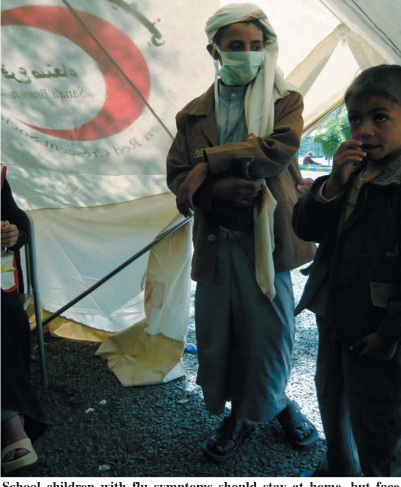
School children with flu symptoms should stay at home, but face masks are not necessary for the general population, says the Ministry of Health.