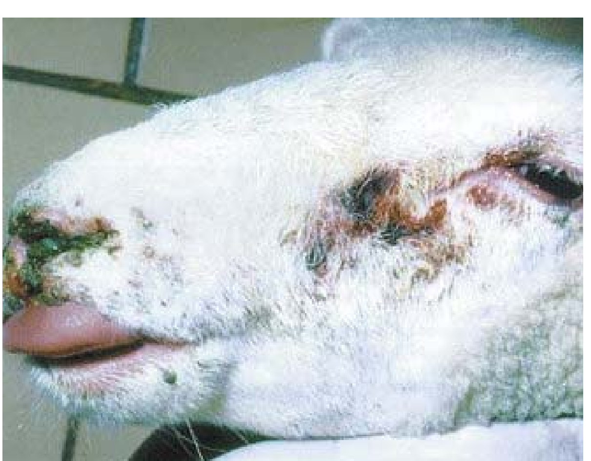
Myiasis has caused more than 1,000 animal deaths while over 60,000 other animals have been vaccinated since last December.

"There are other reasons too, such as the presence of armed people in the emergency unit who accompany the patient, which makes the medical worker confused and lack the ability to control the situation," he said.