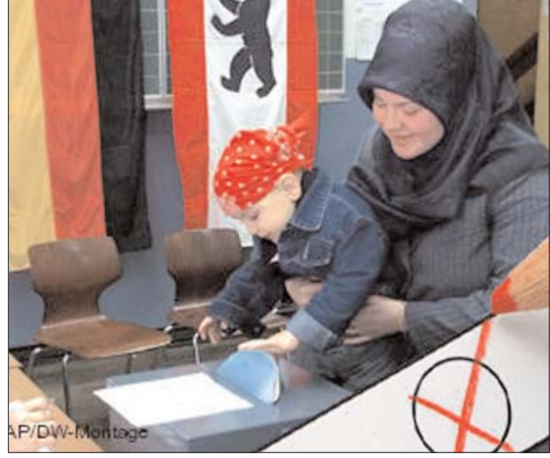
At the ballot box: according to a study from 2009, there are 1.1 million Muslims eligible to vote - some 1.7 percent of total eligible voters

In 2007, only 3.7 percent of respondents reported that they wouldn't vote. Now it is 16 percent and another