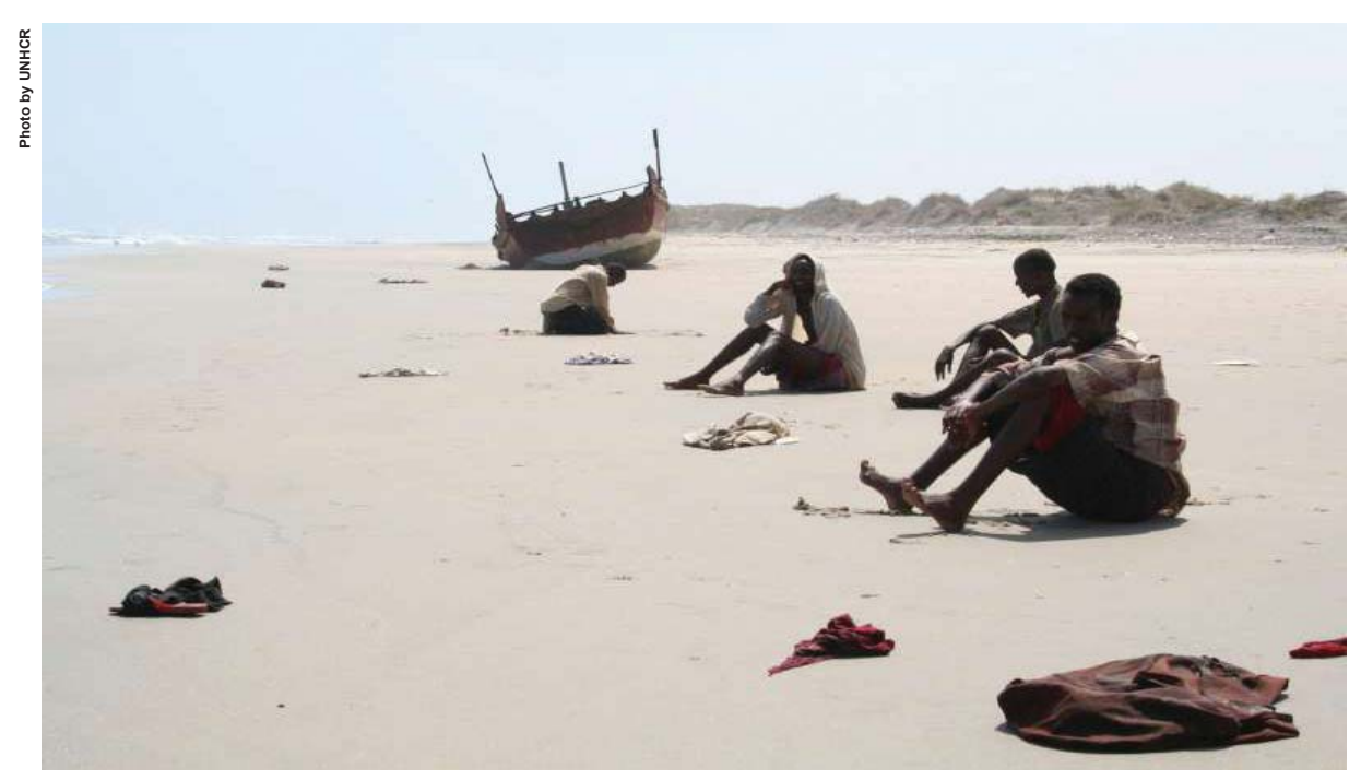
Exhausted survivors wait for help after crossing the Gulf of Aden.