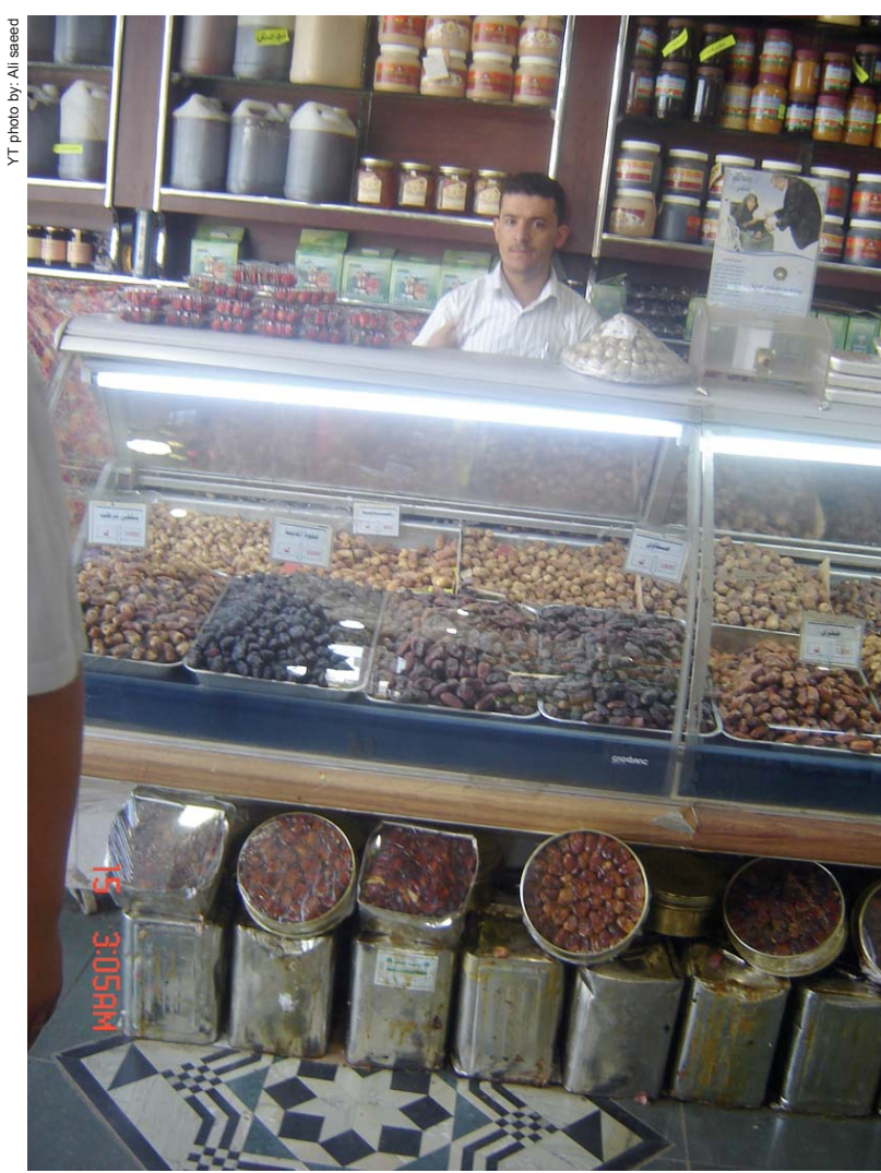
Price of Saudi imported dates to Yemen witnessed a high increasing went up to 60 percent in comparing to the past year due to the late cultivation of crop that delayed until early Ramadan.

"We discovered that laboratories in Sana'a mix dates from last year with