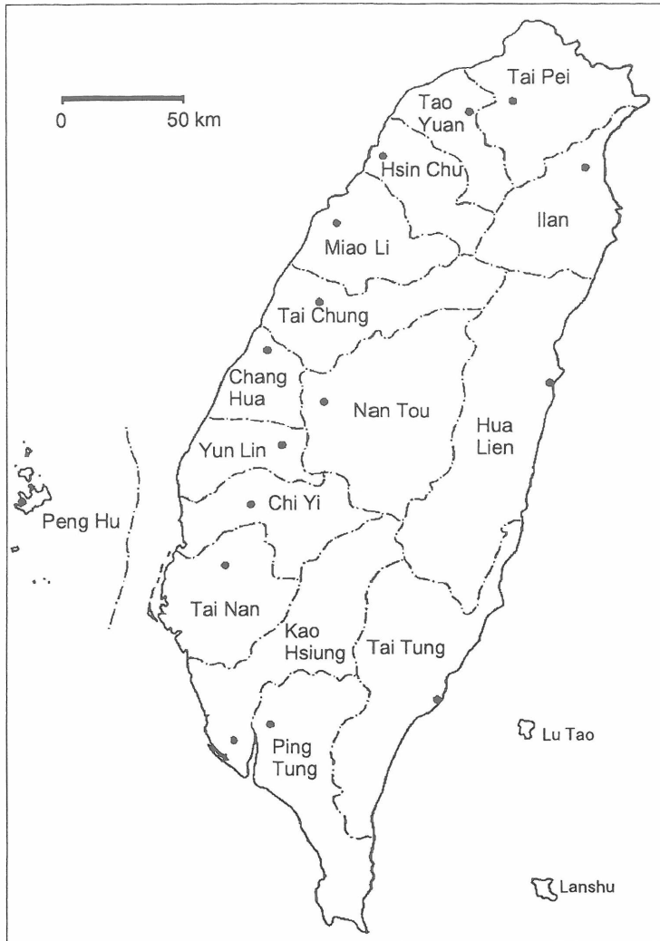
Fig. 1. Map of Taiwan with delimitation of administrative districts or counties. Black dots show position of county capitals. Redrawn from Hsieh (1964).

Taiwan (earlier Formosa) is an island 150 km east of mainland China, from which it is separated by the relatively shallow Taiwan Strait. It is part of the chain of volcanic archipelagoes extending from the Kamchatka Peninsula in the north to the Sunda Islands in the south. The