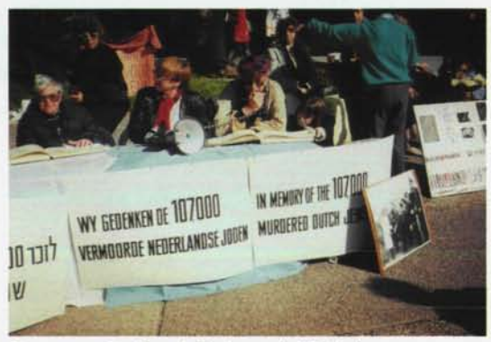
Protest at the Dutch Embassy in Tel-Aviv.

The central activities take place in the