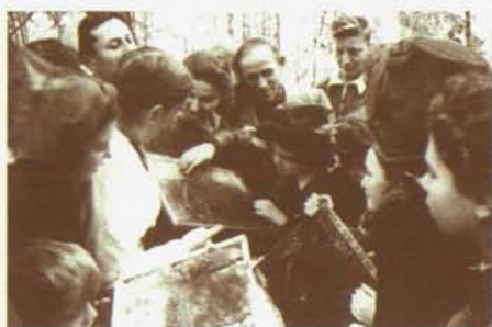
A lesson in apiculture at the Home