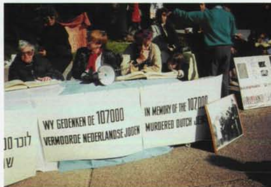
Protest at the Dutch Embassy in Tel-Aviv.

The central activities take place in the