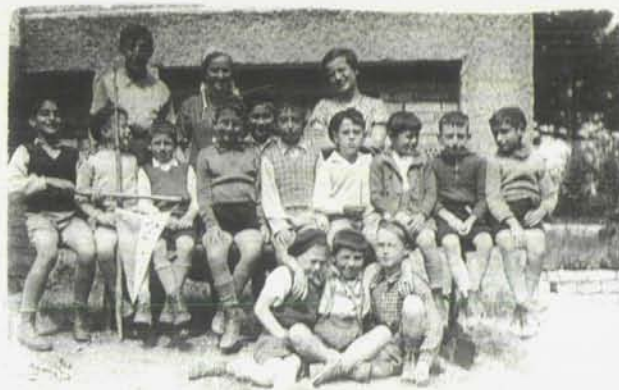
1938, Camp for Jewish German children, Alschwit, Switzerland.

Among the refugees who reached Switzerland before 1939 were the children of the Kindertransporte , the children transports which were organized by aid agencies and Zionist groups. These children, ages three to