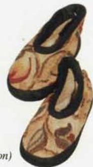
A toddler's slippers from Buchenwald.