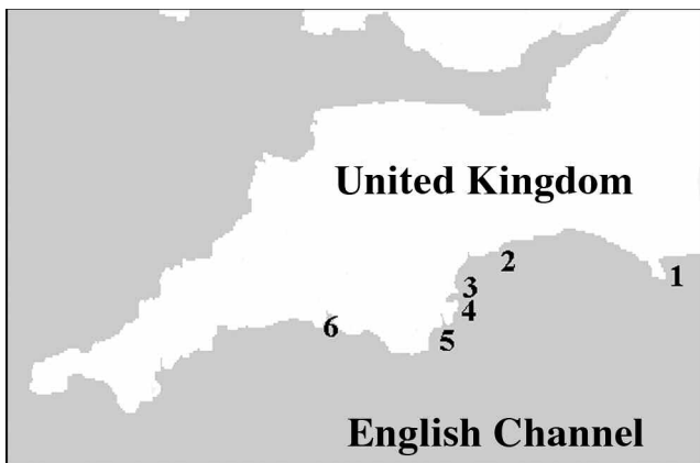
Figure 2. Map showing the South-West region of the UK and the sites at which Sternaspis scutata have been found. Sites: 1. Portland Harbour, 2. Otterton Point, 3. Torbay, 4. Brixham Harbour 5. Kingswear and 6. Plymouth Sound.

Figure 2. Carte de la région du Sud Ouest du Royaume Uni et des localités où Sternaspis scutata a été trouvé. 1. Port de Portland, 2. Pointe de Otterton, 3. Torbay, 4. Port de Brixham 5. Kingswear et 6. Déroit de Plymouth.