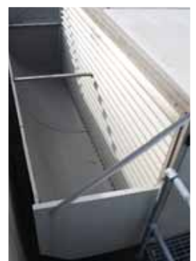
RIGHT: The ahus are squeezed into a pit on the building's roof. ABOVE LEFT: A baffle was added to prevent air short circuiting between the unit's intake and exhaust louvres. ABOVE RIGHT: Since completion a curved scoop has been added to throw the exhaust air clear of the roof pit