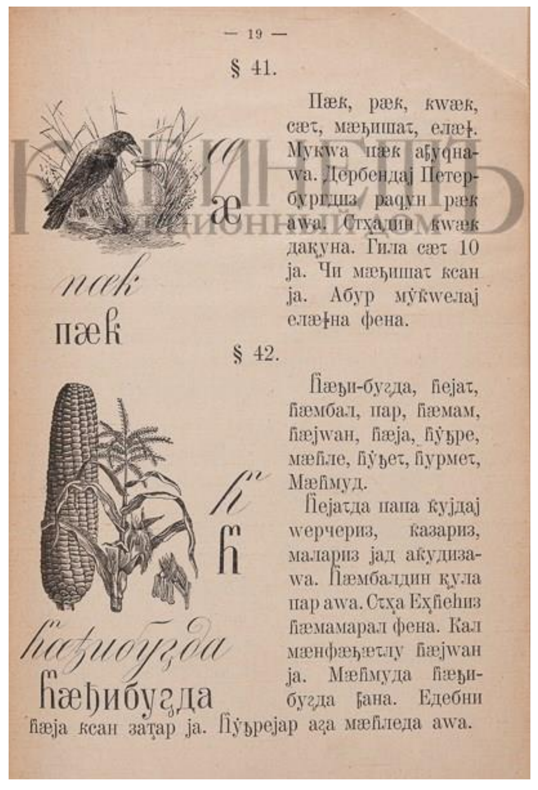
Figure 3. Sample from «Кюринская азбука и первая книга для чтения. Тифлис, издание Кавказского Учебного Округа, 1911»