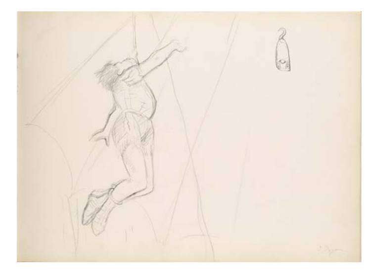
Edgar Degas (1834–1917) Sketchbook (notebook 29), 19<sup>th</sup> century Pencil, charcoal, blue chalk Thaw Collection, The Morgan Library & Museum, New York. 2004.35