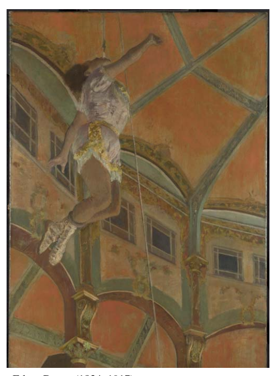
Edgar Degas (1834–1917) Miss La La at the Cirque Fernando, 1879 Oil on canvas, 117.2 x 77.5 cm. Bought, 1925 (NG4121) National Gallery, London, Great Britain

Beginning February 15, the story behind this remarkable work will be told in depth for the first