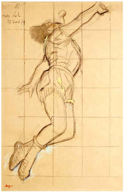
Edgar Degas (1834–1917) Miss La La at the Cirque Fernando, 1879 Black chalk with touches of pastel, 18½ x 12 5/8 in. 36.7

Only in his earliest depiction of the aerialist, dating to January 19, 1879, did the artist show the performer frontally rather than in profile, as she appears in the related painting and the other preliminary studies, all of which are in the