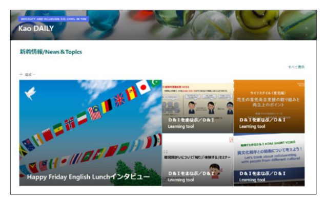
Portal site main page and various educational content