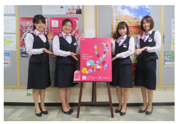
PR panel exhibit (Kashima Office) Note: Masks were only removed when taking this photo.