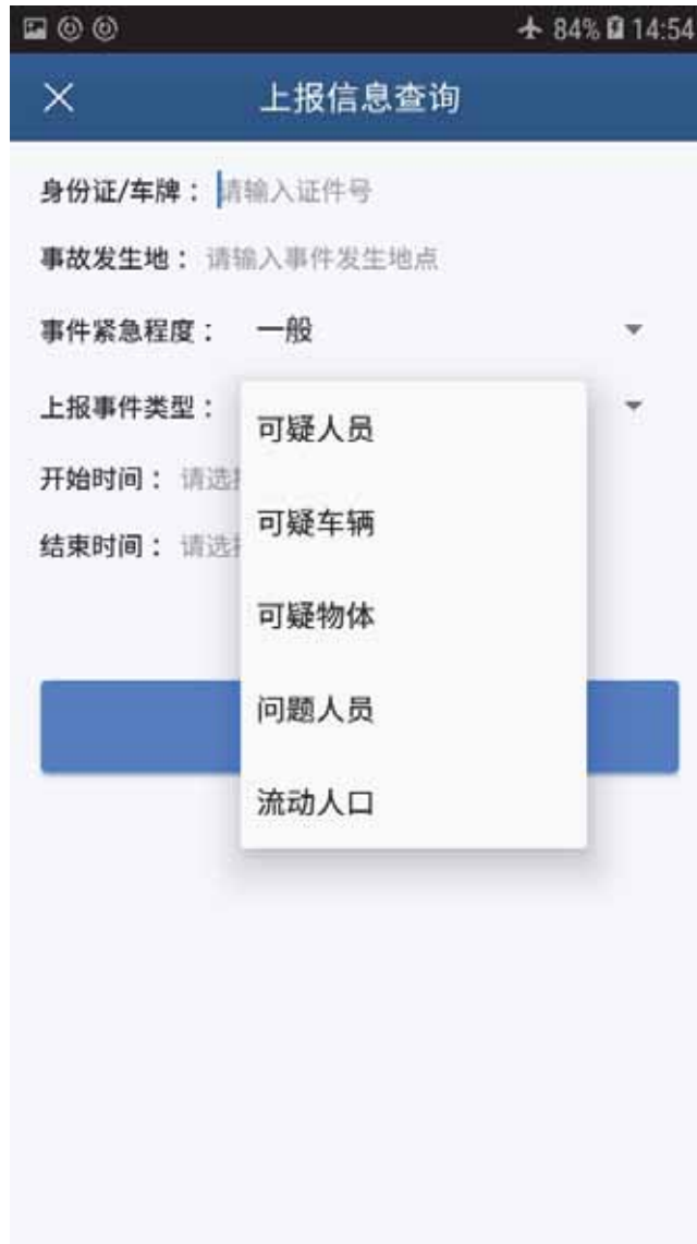
Fig.32: Screenshot showing how officials can search for incident reports filed concerning suspicious vehicles, objects, people, or about internal migrants.