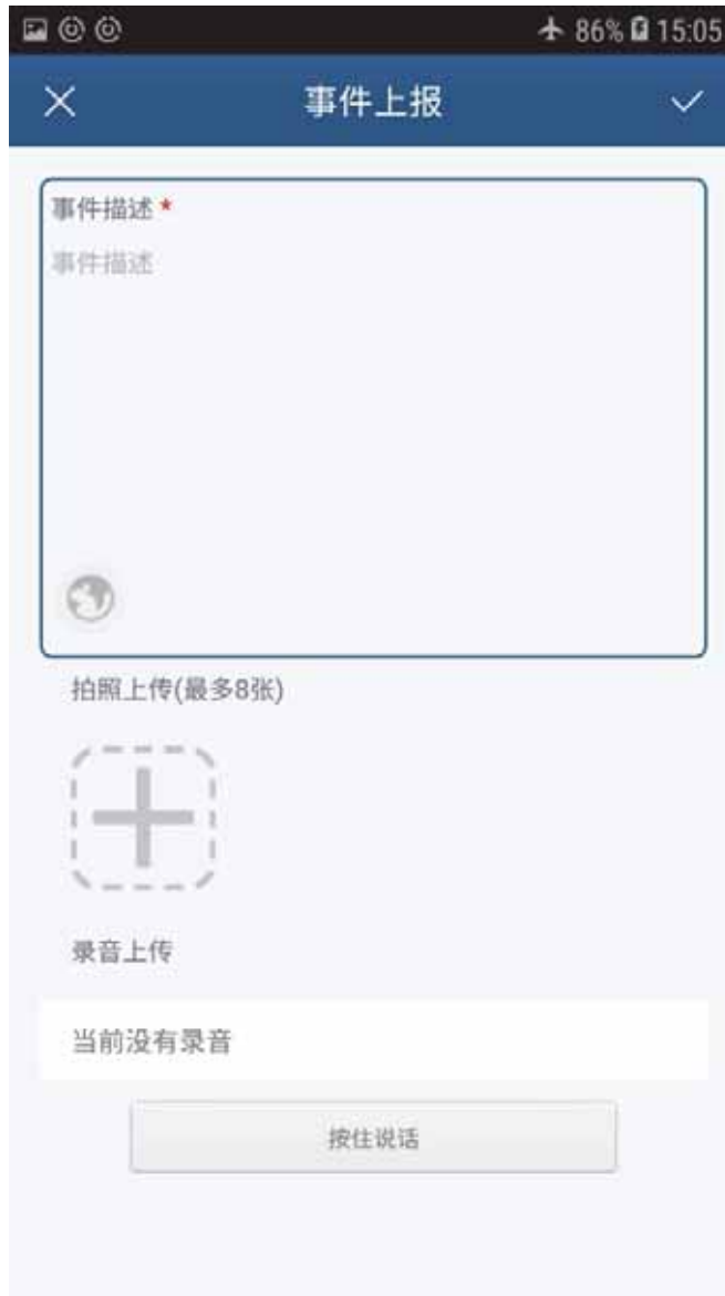
Fig.33: This is how officials can log an incident report.