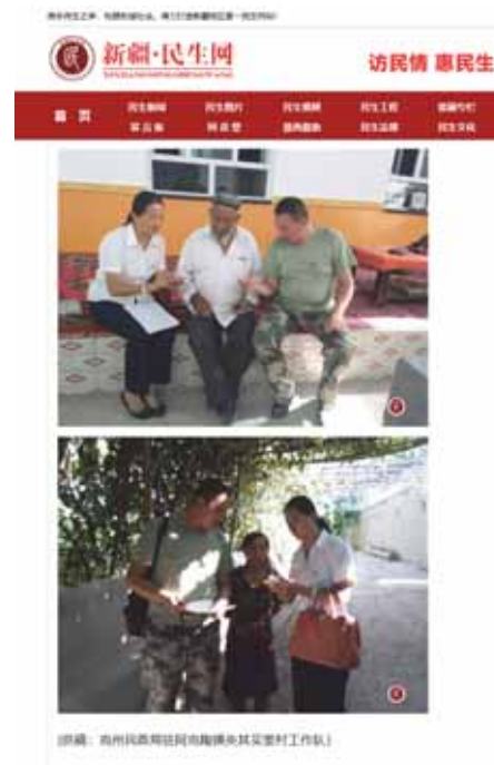
An article written by officials from the Xinjiang Bureau of Civil Affairs shows how they visited villagers and collected their information using the IJOP app in Akto County, Kizilsu Kirghiz Autonomous Prefecture, Xinjiang.

We know that there are at least two other apps that Xinjiang government officials use to gather personal data from residents: an app for Xinjiang officials when they conduct intrusive home