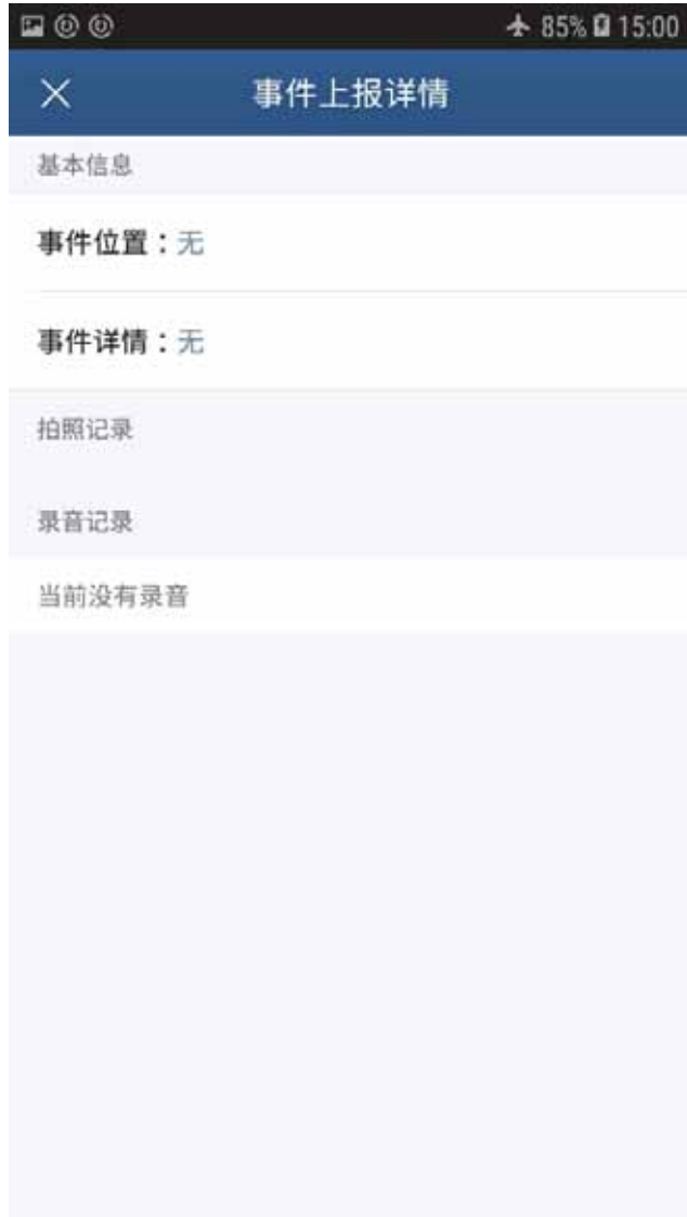
Fig.34: Screenshot showing details of an incident report.