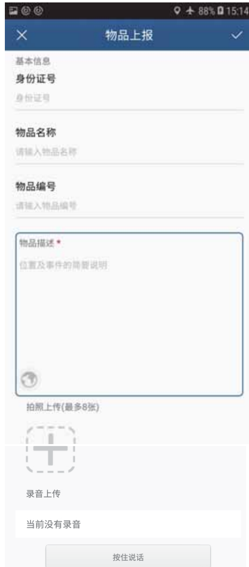
Fig.36: This is how officials can log an object they find problematic.