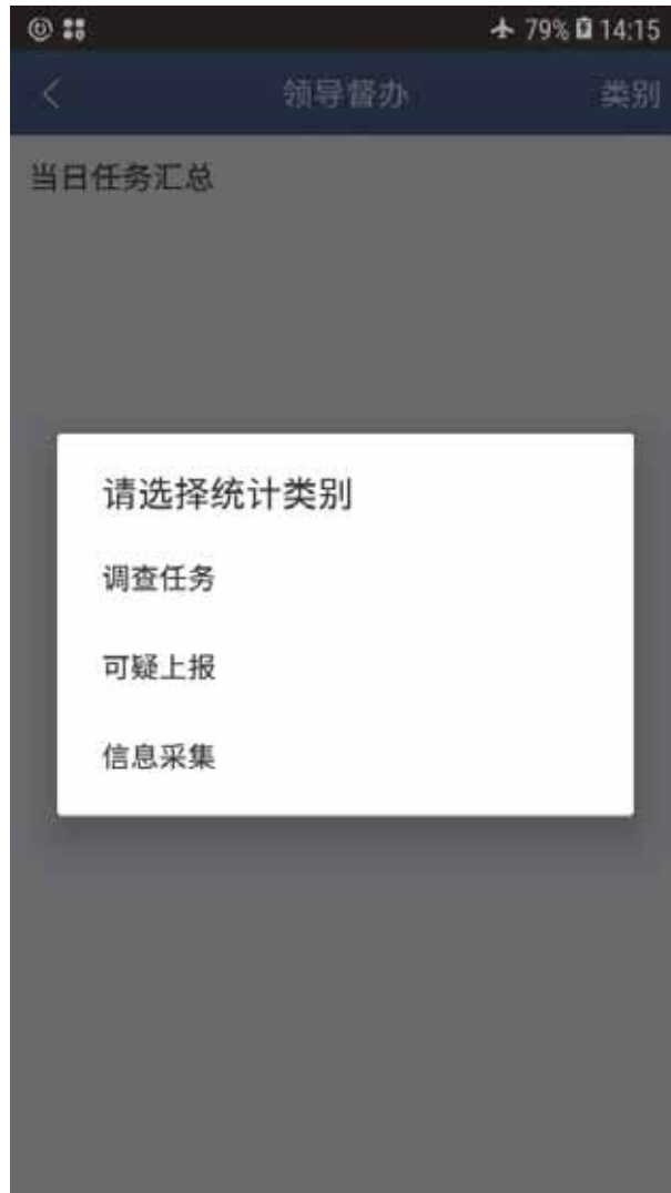
Fig.28: A screenshot entitled “leader supervision” showing how supervisors can keep tabs on lower-level officials as they accomplish IJOP-related tasks.