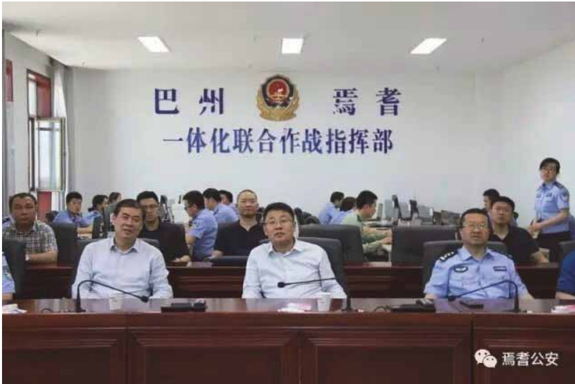
A police WeChat post showing an IJOP command center in Karasahr (or Yanqi in Chinese) Town, Yanqi Hui Autonomous County, Bayingolin Mongol Autonomous Prefecture, Xinjiang.

officer is also prompted to note the person’s behavior, and whether the person seems suspicious and needs to be investigated further.