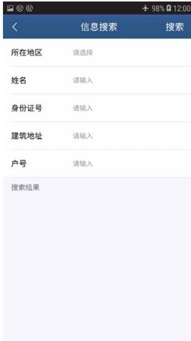
Fig.30: Screenshot showing how officials can search for information about people.