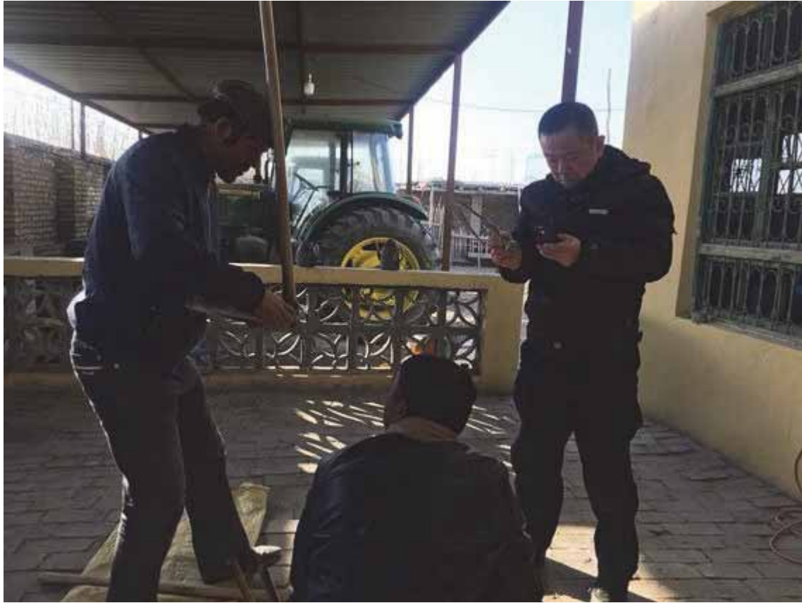
A Xinjiang Police College webpage shows police officers collecting information from villagers in Kargilik (or Yecheng) County in Kashgar Prefecture, Xinjiang.

On this page, the IJOP app requests different types of data depending on the type of situation in which information is being collected. For example, when officials are collecting information from people “on the street,” “in political education camps,” or “during registration for those who have gone abroad,” the app further prompts them to choose from a drop-down menu whether the person in question belongs to one of 36 types of problematic “person types.”