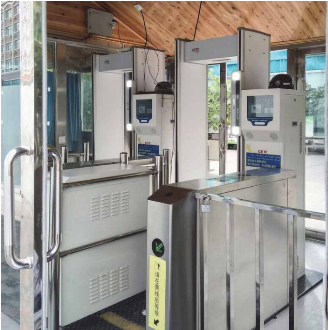
CETC’s “three-dimensional portrait and integrated data doors” – special machines that are used in some of Xinjiang’s checkpoints to vacuum up people’s identifying information from their electronic devices. This is placed at the entrance to the Aq Mosque, in Urumqi, 2018.