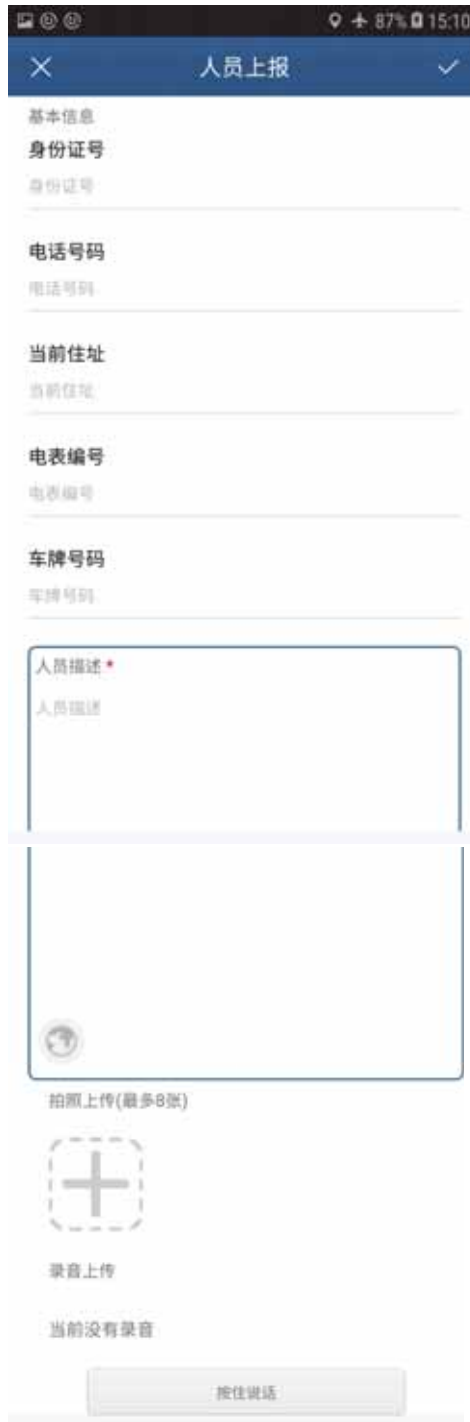
Fig.35: This is how officials can log a report about a person they find problematic.