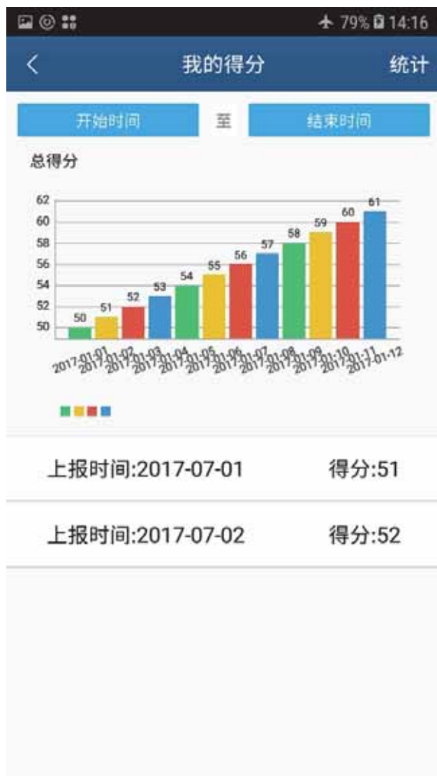
Fig.29: A screenshot entitled “my score” evaluates officials’ progress accomplishing IJOP-related tasks.