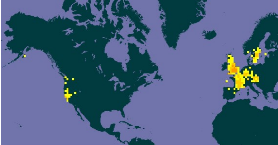
Figure 1. Global distribution of P. leniusculus . Map from GBIF (2015).