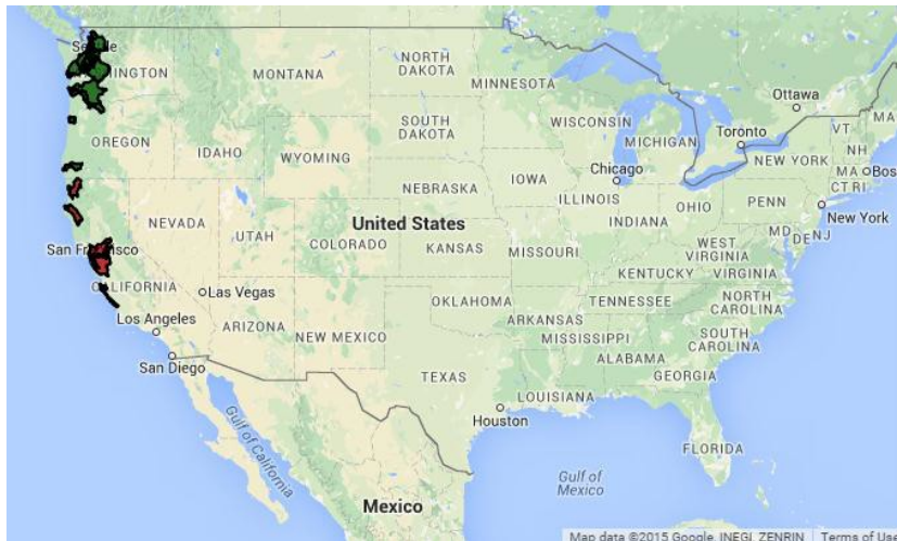
Figure 2. Native (green) and introduced (red) ranges of P. leniusculus in the continental U.S. Map from Fofonoff et al. (2003).