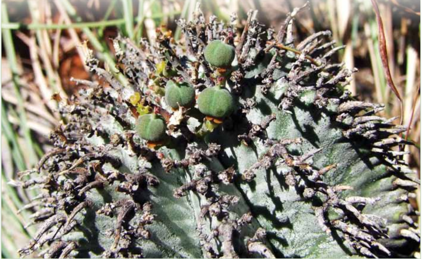
Fig. 1: Fruiting Euphorbia polygona var. minor

Euphorbia polygona Haw. and Euphorbia horrida Boiss. are phenotypically 1) very similar taxa that appear to be closely allied to each other. Other close relatives are Euphorbia anoplia Stapf and Euphorbia inconstantia R.A.Dyer. White et al. (1941) already suspected that the latter is a natural hybrid. Also according to Bruyns (2012), it is an interspecific cross, possibly between Euphorbia heptagona L. and E. polygona . Therefore, Bruyns excluded E. inconstantia from his nomenclature and typification of southern African species of Euphorbia (Bruyns, 2012). Apparently Bruyns made a mistake in the name of one of its parents: E. heptagona does not reach any population of E. polygona var. polygona , and E. inconstantia does not display features of Euphorbia enopla Boiss. that occurs in the same area as E. polygona and which Bruyns (2012) relegated to synonym of E. heptagona .