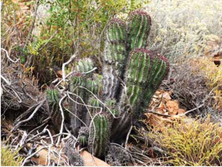
Fig. 3: Euphorbia polygona var. polygona