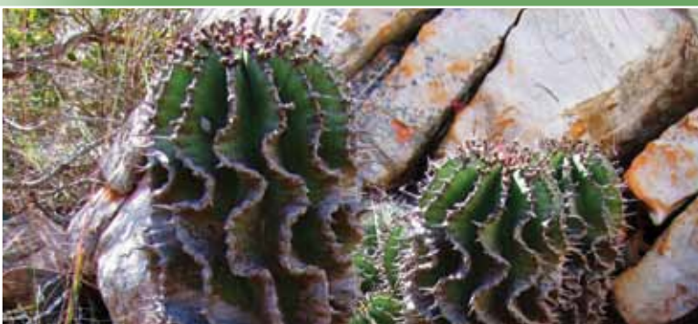
Fig. 7: Euphorbia polygona var. polygona with wavy angles