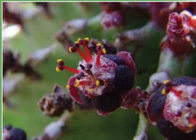
Fig. 6: Euphorbia polygona var. polygona , close-up of a male cyathium