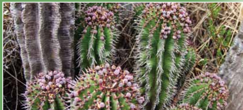
Fig. 8: Euphorbia polygona var. polygona , a comparatively strongly spined specimen

To read the entire paper with detailed descriptions of all varieties established or accepted by the author, a key to all varieties and a table comparing the most important parameters for differentiation (all in all 21 pages), you have to become member of the IES to receive the current issues or accept a delay period of two years for to buy back issues before you can order Vol. 9 (2) of June 2013.