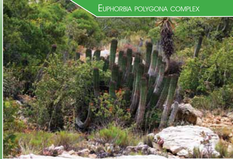
Fig. 4: Euphorbia polygona var. polygona in its habitat near Grahamstown