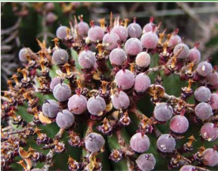
Fig. 5: Capsule of Euphorbia polygona var. polygona