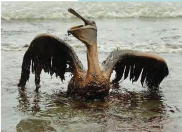
Oil-covered pelican caught in the BP spill.

"It is terrifying to think that the tragedy in the Gulf could one day happen along our coast. The ocean is not only our lifeline, but it is a precious resource that needs to be protected. As a lifelong resident of the Shore, and a local business owner, I feel we must do everything necessary to protect it from offshore drilling and industry."