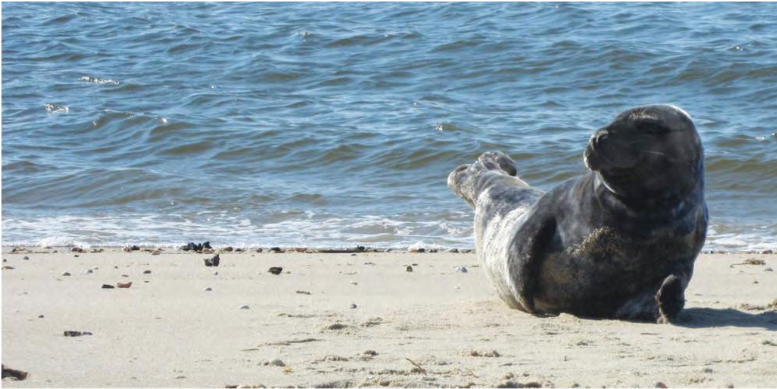
Gray seal resting on the beach in Long Branch, New Jersey.