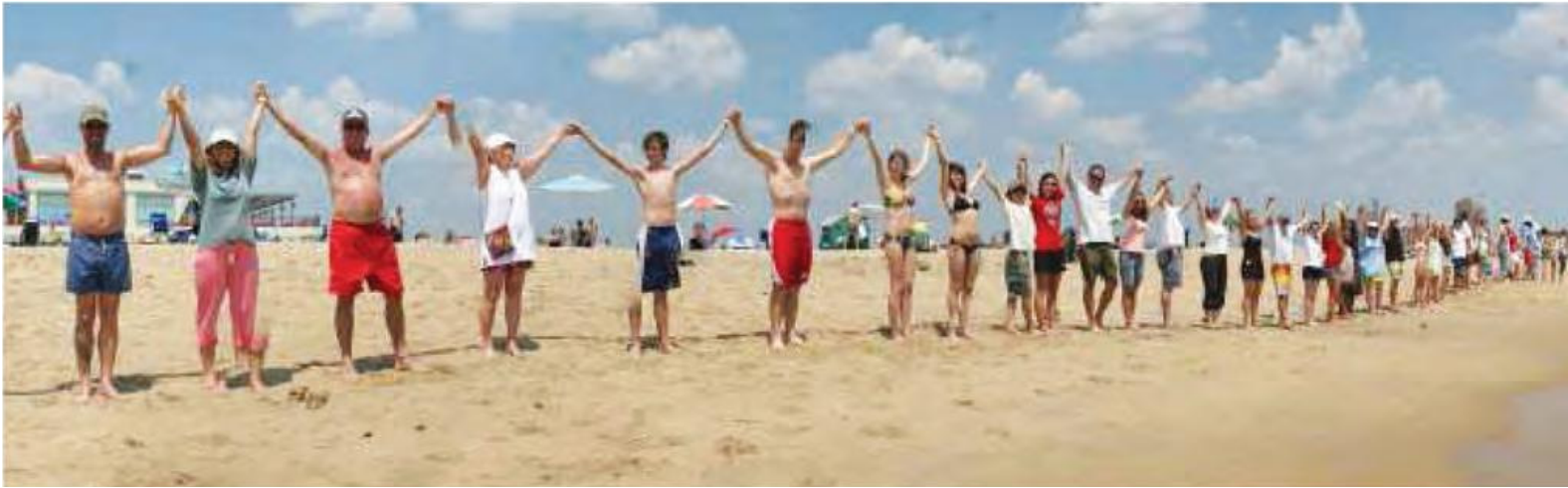
Hands Across the Sand participants in Asbury Park.