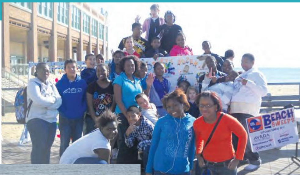
Above right: Students from Hope Academy Charter School join the Fall Beach Sweeps in Asbury Park.

(represents 48% of 33 municipalities in the Barnegat Bay Watershed)