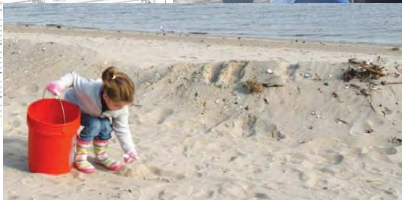
Above Left: Data card used to record each piece of trash collected. Bottom left: Girl collects trash at Union Beach site.