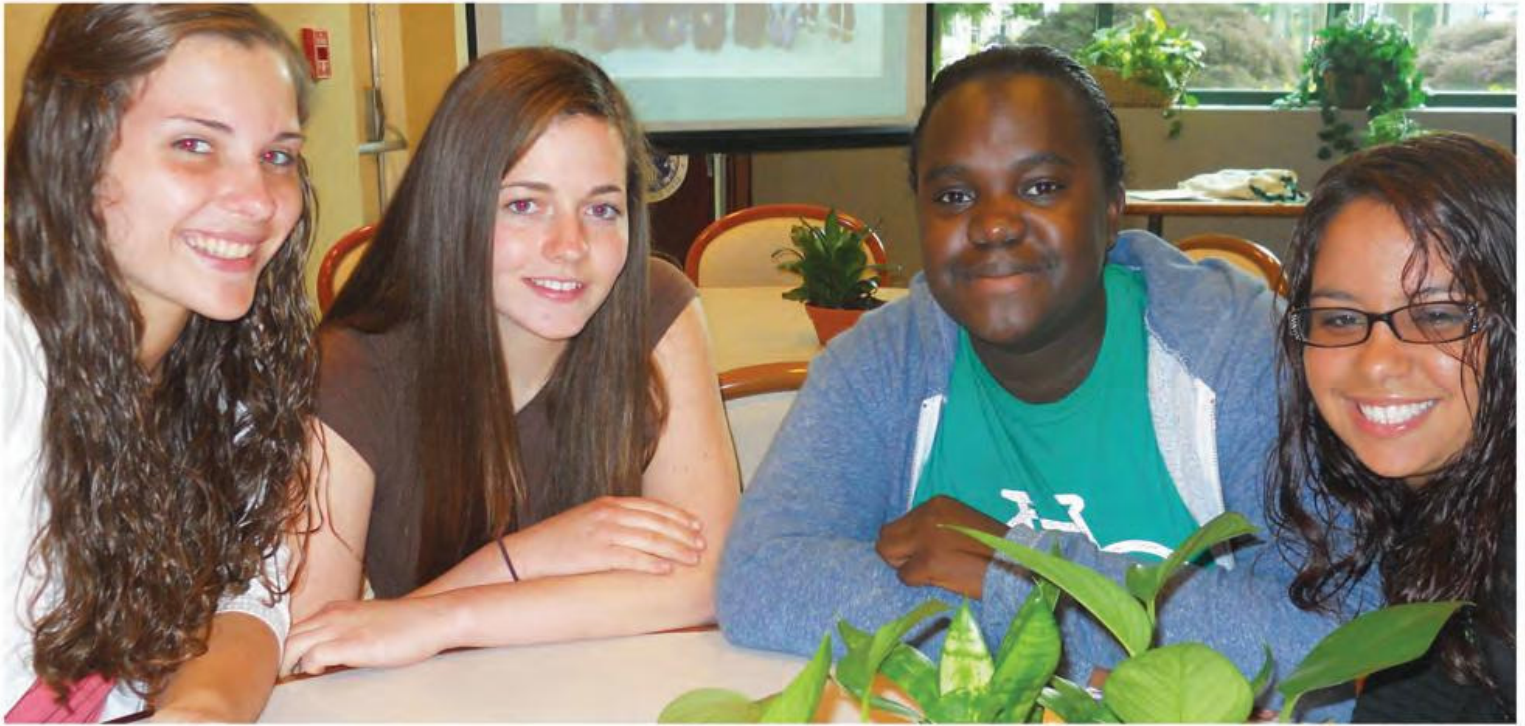
Student Ocean Advocates from Monmouth County (above) plan their campaign, while Ocean County Advocates (right) work on campaign posters and materials.