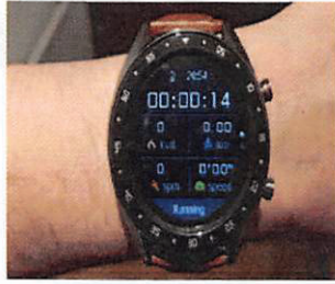
Every Senior In USA Should Be Wearing This... OshenWatch Luxe