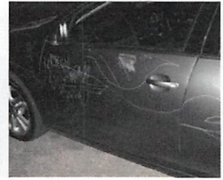
Use This To Remove Car Scratches Instantly Remove Car...