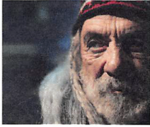
Tommy Chong Says "Throw Out Your CBD" Tommy Chong