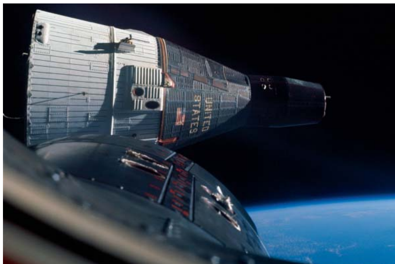
Figure 2. Gemini 7 in orbit alongside Gemini 6 from which this image was taken about 290km above the Earth on 15 December 1965.

This is a well-written and presented addition to the Haynes series and will appeal to anyone with an interest in the engineering challenges of the Apollo Moon landing programme. It covers an important