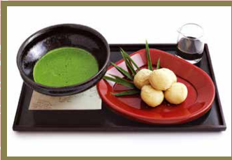
White Mochi and Matcha Set Meal ¥1,000