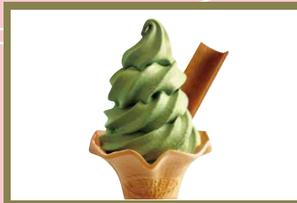
"Kyoto Matcha" Ice Cream Cone ¥400