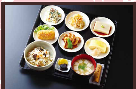
Yatsuhashi Set Meal ¥1,800