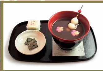
Nishio Red Beans Syrup ¥650