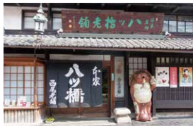
① Nishio Yatsuhashi Honten