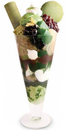
Premium Nishio Matcha Sundae