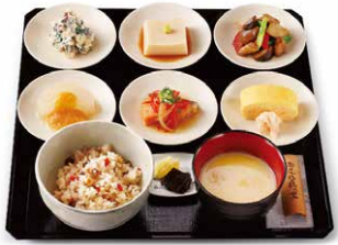
Yatsuhashi Set Meal