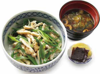
Fried Tofu Donburi