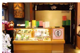
⑧ Gion Kita