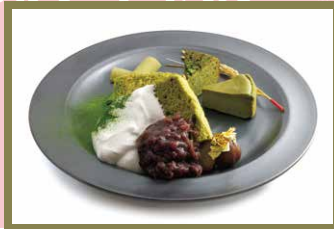
Premium Matcha and Rice Cake Plate ¥1,200