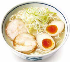
Kyoto Ramen with Chicken