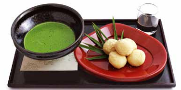
White Mochi Matcha Set Meal