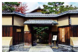
⑬ Nishio Yatsuhashi no Sato