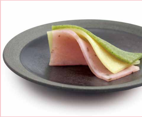
Nama Yatsuhashi Slice ¥250/185g