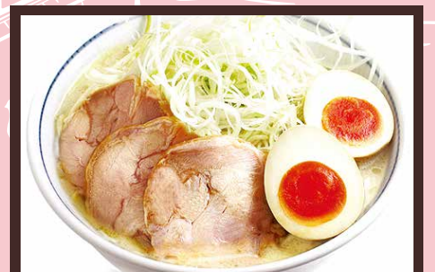
Kyoto Ramen with Chicken ¥980