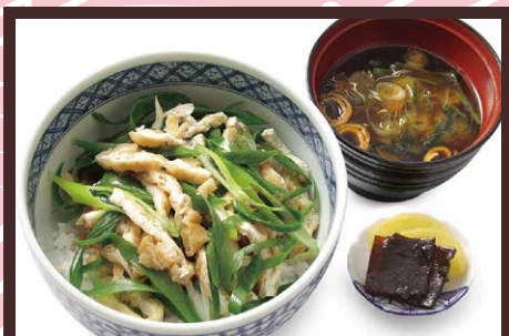
Fried Tofu Donburi ¥800