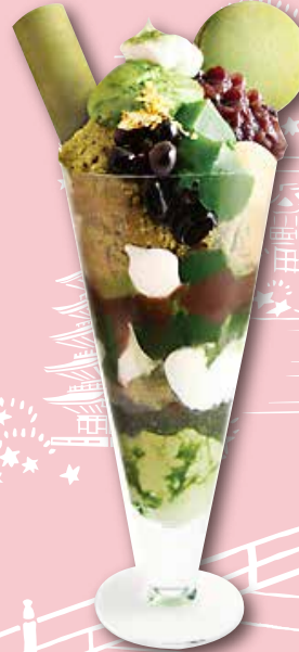
Premium Nishio Matcha Sundae ¥1,200