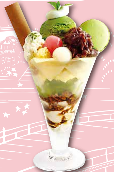
Nishio Yatsuhashi Sundae ¥1,000