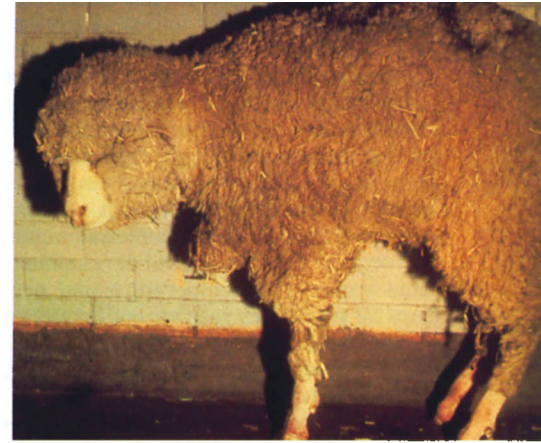
Bluetongue virus, spread by Culicoides gnat, causes mouth ulcers in sheep and lameness due to edema, inflammation of the hoof wall, and muscle damage. Abortion and congenitally deformed lambs may also occur.