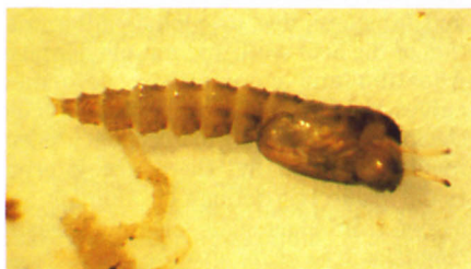
Culicoides variipennis (adult, above, and pupa, left) is widely distributed, especially in southern areas of the state. It often occurs in sites such as dairy lagoons, where dense populations expose animals to high biting intensity.