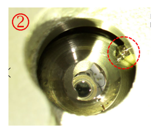
The foreign debris can be very small