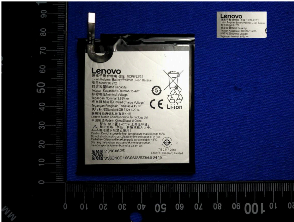
Battery (BL272 3,85V 4000mAh 15,4Wh)