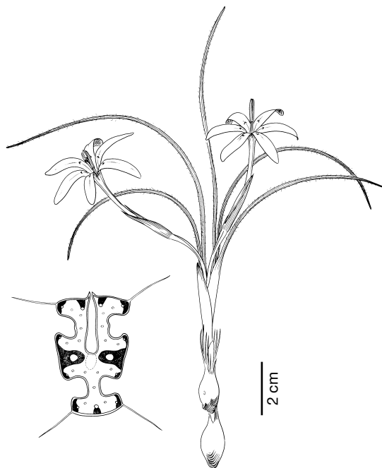
Fig. 5. — Morphology of Romulea albiflora : with transverse section of the leaf much enlarged (Goldblatt & Manning 10367). Drawn by John MANNING.

drawn into coarse fibers above, these accumulating with age and forming a neck around the base of the stems, 8-10 mm diam. Leaves c. 5, all basal, up to twice as long as the flowering stems, narrowly 4-grooved, softly hairy throughout, 1.5-2 mm diam. Inflorescence of up to 5 solitary flowers, outer bracts green with narrow, translucent or white membranous margins, 18-25 mm long, inner bracts with fairly broad membranous margins c. 2 mm wide, about as long as the outer. Flowers hypocrateriform, white, the tepals flushed mauve on the reverse, the inner distinctly veined, the tube streaked with broad bands of mauve opposite the outer tepals and yellow opposite the inner tepals, unscented; perianth tube cylindrical, 20-33 mm long; tepals narrowly oblong, 12-16(-20) × 2.5-4 mm long, the inner slightly smaller than the outer. Filaments inserted at the mouth of the tube, c. 4 mm long, glabrous, anthers parallel and contiguous, 6-7 mm long, dark purple, the pollen reddish brown. Style dividing near the anther apices, the branches c. 2 mm long, divided to slightly below the middle. Capsules and seeds unknown. Flowering: late Sep. and Oct. — Fig. 5.