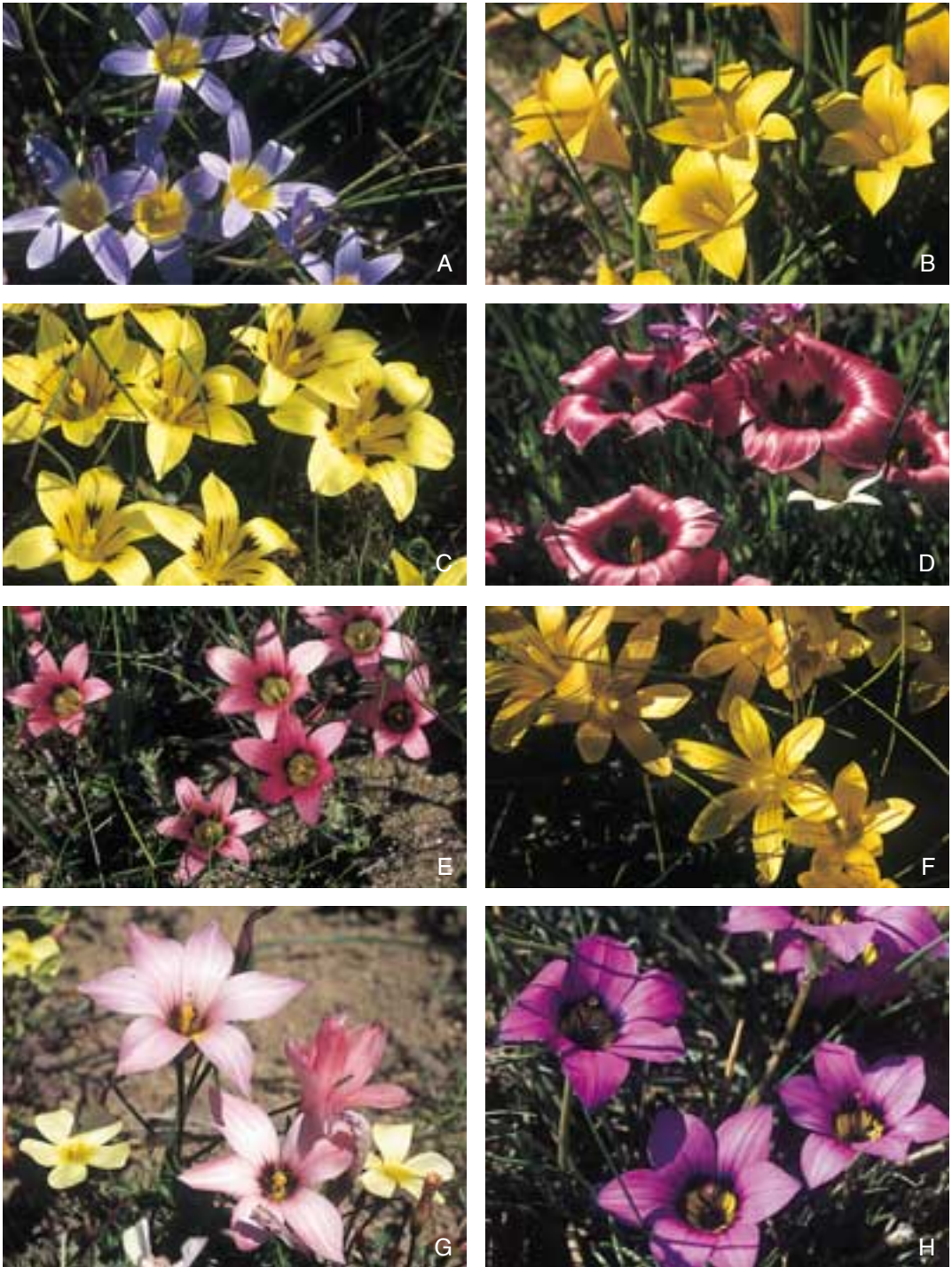
Fig. 2. — Flowers of Romulea species: A , R. tabularis ; B , R. saldanhensis ; C , R. tortuosa ; D , R. sabulosa ; E , R. eximia ; F , R. sulphurea ; G , R. namaquensis ; H , R. komsbergensis .