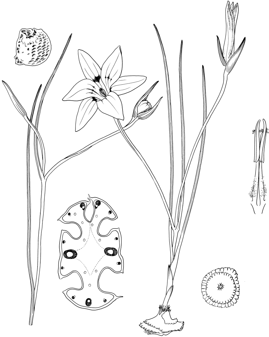
Fig. 3. — Morphology of Romulea discifera : full size, detail of the stamens and style branches, seed, and transverse section of the leaf much enlarged (Goldblatt & Manning 11075). Drawn by John MANNING.

tance north of Nieuwoudtville on the Bokkeveld Plateau in Northern Cape Province. Plants grow in a renosterveld community dominated by Elytropappus rhinocerotis among a dense ground cover of geophytic plants. The soil is a mixture of quartzitic sand and pale-colored clay and appears to be well drained although in particularly wet years may be waterlogged during part of the