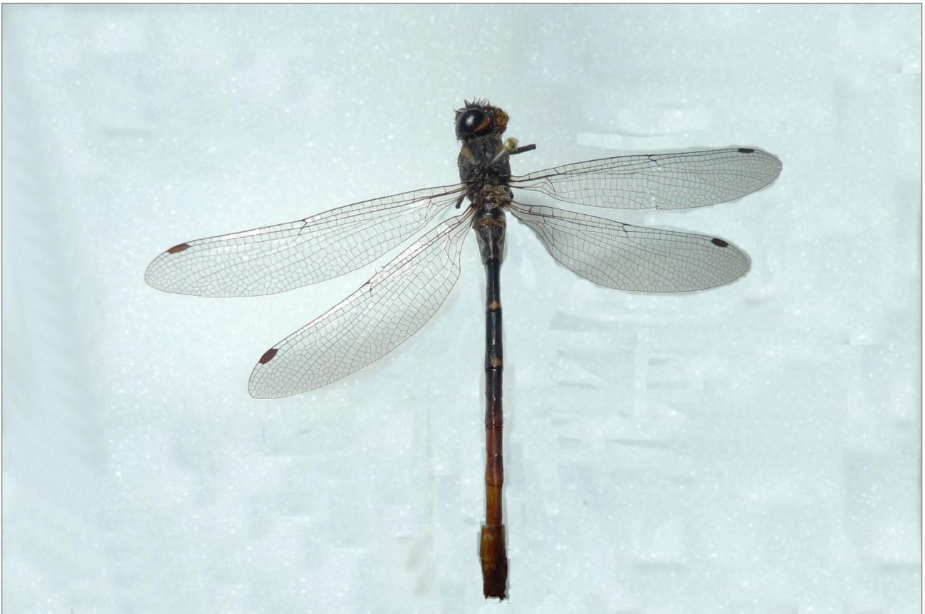
Figure 1. Epiophlebia sinensis , North Korea, northwest of Mt. Pukpotae

Material examined: One male (Figure 1), southern tributary of Sohongdan river, 5 km NEE Lake Samjiyon, NW Mt. Pukpotae (Mt. Pukphotae), 41°51'11"N 128°23'14"E, Samjiyon County, Ryanggang province, D.P.R. of Korea (Figure 2), 1–12-VI-2012, alt. 1380 m a.s.l., Che junhong leg.