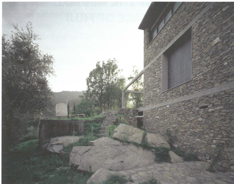
The Stone House with the chapel of the Madonna del Piano in the background.

floor underwent the most changes during the design process. In early sketches, different versions of a cut-away terrace were explored. It also incorporated the framing of a specific view – in one version, the imposing silhouette of Porto Maurizio, and in another, the neighbouring chapel. In its realized form, this part of the building is an internalized equivalent to the open portico: a neutral stage-like space where each of the inhabitants must negotiate his or her individual place within it.