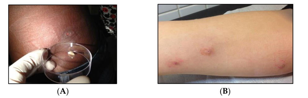
Figure 1. Cutaneous myiasis caused by Dermatobia hominis (A) and Cochliomyia hominivorax (B) larvae.