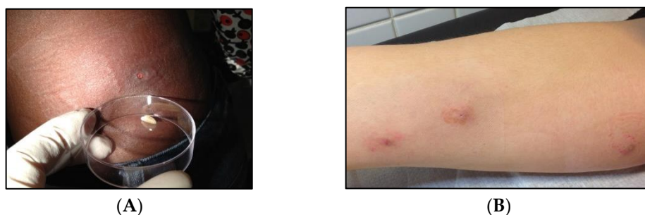
Figure 1. Cutaneous myiasis caused by Dermatobia hominis (A) and Cochliomyia hominivorax (B) larvae.