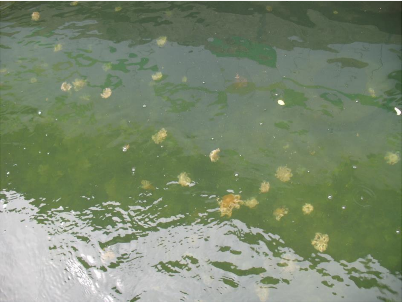
Fig 1. Blooms of Cassiopea at Sentosa Cove on 17 May 2008. Note individuals drifting about at the water surface and many more, deeper down. (Photograph by: Lionel Ng).