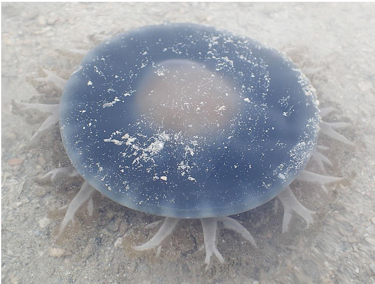
Fig. 3. In situ view of a Cassiopea of approximately 15 cm bell diameter at rest, with the surface of its bell facing upwards, in shallow water at Semakau Landfill on 4 November 2017.