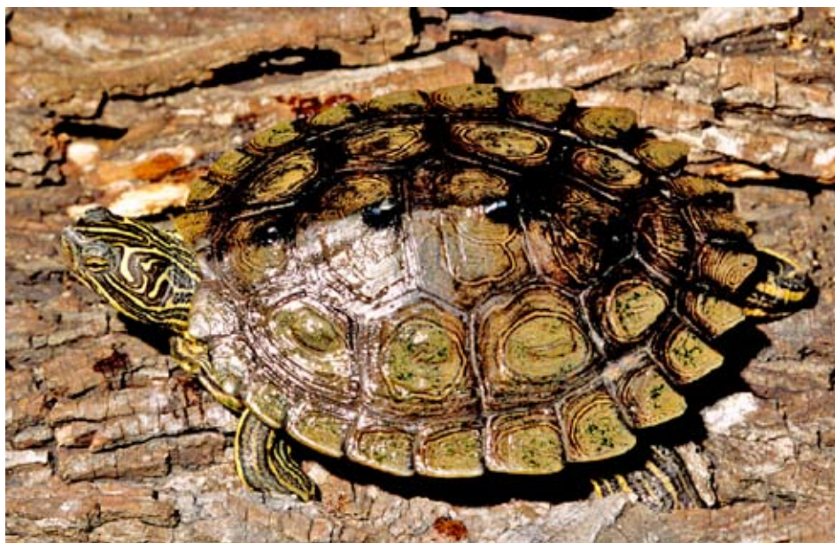
Figure 1. Adult male Graptemys nigrinoda from Alabama, USA.

to the subspecific designations presented by Folkerts and Mount (1969). Freeman argued that “Folkerts and Mount have failed to show that delticola has any clear-cut sets of characteristics which are peculiar to the region which it inhabits.” He claimed the authors failed to demonstrate any “steps” or breaks in certain morphological features within the species’ range. Freeman contended that the authors were dealing with an example of geographic variation manifested by several north to south clines. Additionally,