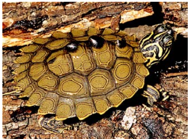
Figure 3. Hatchling Graptemys nigrinoda from Alabama, USA.

The carapacial ground color of the northern black-knobbed map turtle is greenish olive to brown. The median vertebral projections are black. Thin yellow-green, nearly circular rings are present on the pleurals. The rings are outlined in black and may encircle a dark central smudge (Lahanas 1986). The lateral portion of the vertebrals possess light reticular markings. The dorsal surfaces of the marginals have complete or incomplete light circular lines. The ventral surfaces of the marginals have concentric dark rings at the sutures (Cagle 1954). The plastral ground color is yellowish with narrow dark lines bordering the sutures