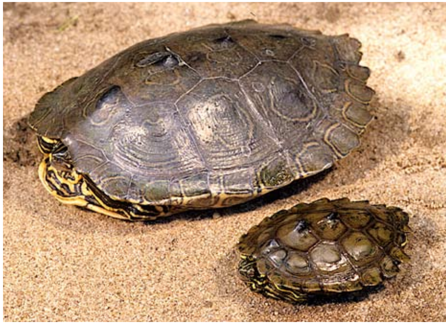
Figure 2. Sexual size dimorphism in Graptemys nigrinoda . Adult female above, adult male below.

Freeman argued that because the range of G. nigrinoda is continuous and the designated zone of intergradation is extensive, “it seems improbable that ‘well-defined’ geographic races have developed.” Folkerts and Mount (1970) rebutted Freeman’s arguments, and G. nigrinoda has since been considered polytypic by most herpetologists.