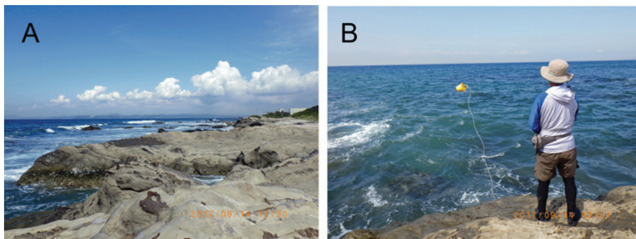
Figure 2. A, sampling site at Banda, Tateyama, Chiba Prefecture; B, sea water sampling operation with a bucket.

fused at 6000g for 1 min to remove seawater and RNA-later for DNA extraction. In order to completely remove liquid remaining in the cartridge, an aspirator (QIAvac 24 Plus, Qiagen) was used. The Sterivex cartridge was subjected to lysis using proteinase K. Before the lysis, PBS (220 \mu l), proteinase K (20 \mu l) and buffer AL (200 \mu l) were mixed and the mixed solution was gently pipetted into the Sterivex cartridge from an inlet port. The Sterivex cartridge was again sealed and then incubated in a 56 °C pre-heated incubator for 20 min, using a rotator (Mini Rotator ACR-100, As One) with a rotation rate of 10 rpm. After the incubation, the Sterivex cartridge connected with a 2 ml tube (DNA LowBind tube, SARSTEDT), which was placed in a 50 ml conical tube, was centrifuged at 6000g for 1 min to collect the DNA. The collected DNA solution (ca. 900 \mu l) was purified using the DNeasy Blood and Tissue kit following the manufacturer's protocol.