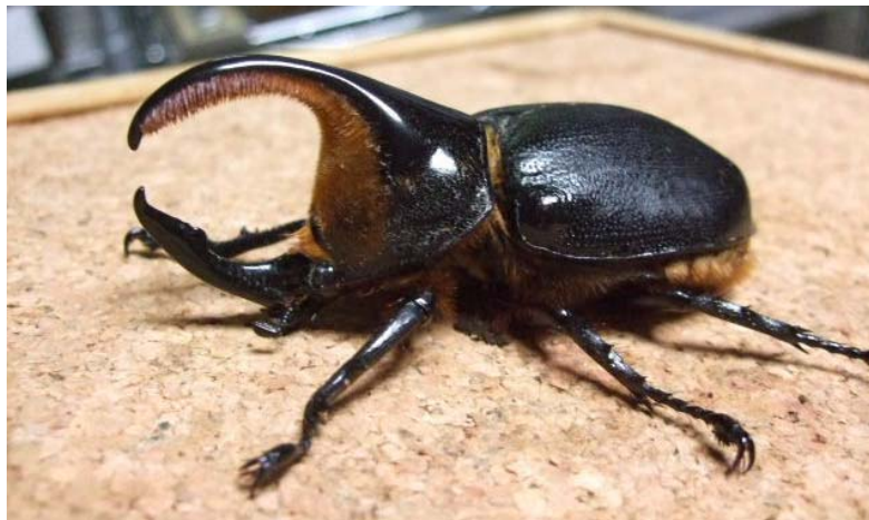
Figure 2. Satanus beetle ( Dynastes satanas )