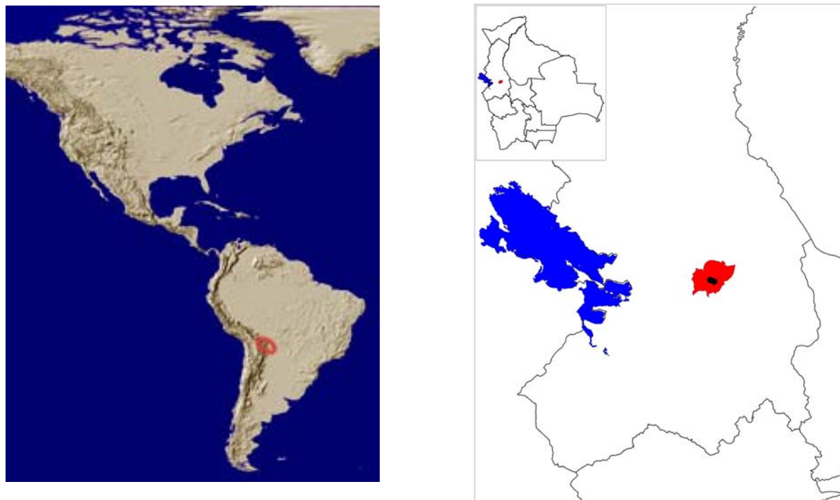
Figure 2. Geographical location of the range of the Satanas beetle in the department of La Paz

The range of the Satanas beetle includes the municipalities of Zongo, Suapi, Chairo, Pacallo, Charobamba, Coroico Viejo, Yolosa, Santo Domingo, Florida, Villa Aspiazu, Chojlla, Chulumani, Irupana, Apa Apa and San Juan de la Miel in the department of La Paz, and Yungas del Chapare (no specific municipality) in the department of Cochabamba.