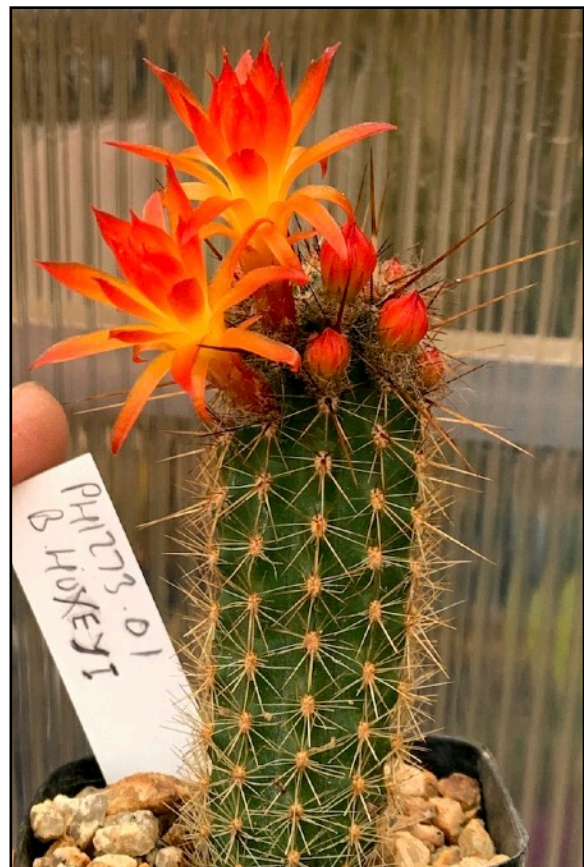
Borzicactus/Loxanthocereus hoxeyi

You can join the CACSS FB page at: https://www.facebook.com/groups/cacss2/