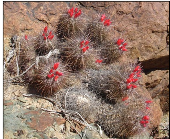
Mammillaria cochemiea maritima