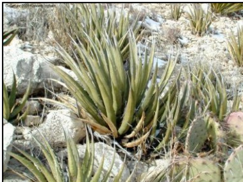
Above Artemisia tridentata , right Yucca brevifolia .