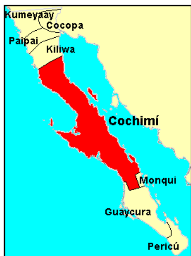
Cochimi territory in Baja.

The Cochimí were the native inhabitants of central Baja California from El Rosario in the north to San Javier in the south. They were simple hunter-gatherers with no knowledge of agriculture or metallurgy. They may have learned the technique of pottery-making before the arrival of the Spanish, but their culture was simple, conforming to their arid environment and nomadic lifestyle. They relied on fishing in the coastal areas and gathering fruits, including cactus and seeds, for survival in other areas.