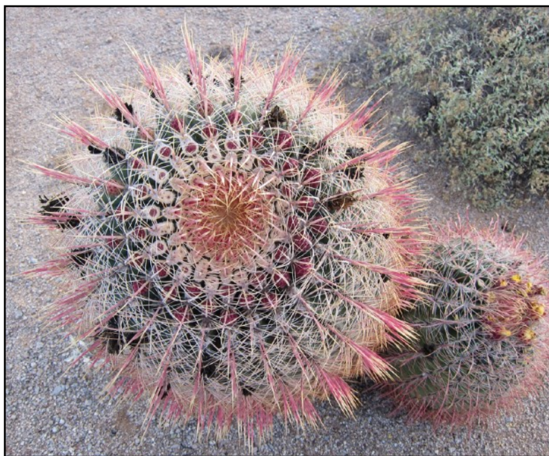
Ferocactus acanthodes with pink spines.

The genus Ferocactus has something for everybody. For me, it is the knowledge that I am not the only thing in the desert during late summer. For some people, it can be enjoyment of the very large members of the genus, such as F. diguetii , F. emoryi and F. wislizeni . While it can be a miserable time of the year, it tends to secure exclusive time to enjoy the plants. Others will like the genus members that are excruciatingly slow— F. chrysacanthus comes to mind—so it will not outgrow the space of potted collections.