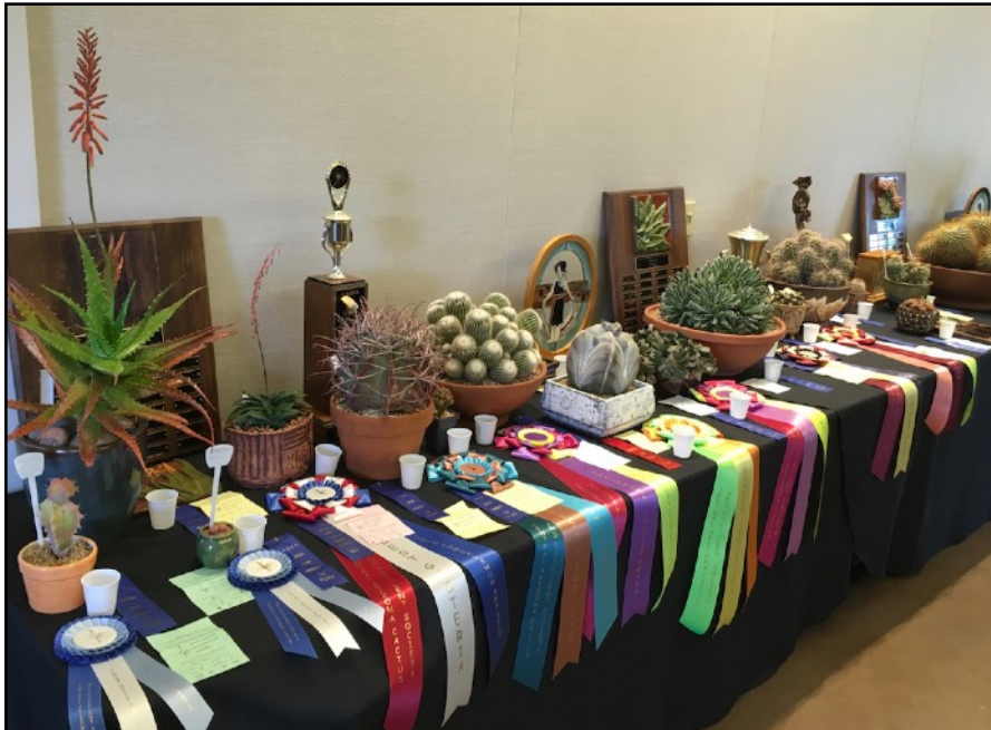
Trophy winners from the 2018 show.

The 2019 CACSS Show and Sale will be held in Dorrance Hall and Boppart Courtyard on April 5, 6, and 7. Daily event times are 9 a.m. to 5 p.m., Friday and Saturday, and 9 a.m. to 4 p.m. on Sunday.