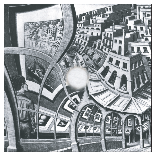
Figure 1 : The original 'Print Gallery'.

According to Escher<sup>[1]</sup>, in order to explore the print it is best to start in the lower right corner (Fig. 1). Right there is the entrance of the print gallery in which artwork is exhibited. Through window beams the viewer sees in fact works of Escher himself. These are hung side by side, enlarging as the viewer's gaze continues to move along the gallery to the left of the print. There a young man is looking at one particular print showing a ship at anchor. The top half of the print is filled with a drawing of a seaport town. Back to the right of the print the attention is drawn to the upper floor of a house. A woman looks out at an open window apparently in eye-contact with the young man (or is he rather looking at the boy on the roof?), and underneath Escher drew a glasshouse that is being supported by the window beams of the print gallery itself. This final turn concludes the circular movement. Regarding the so-called 'blank', Escher explains it as being a guide for the viewer to take the journey through the print.