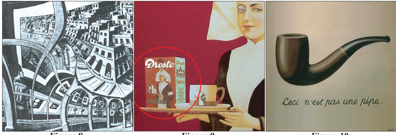
Figure 8 : A filled in 'Print Gallery'.

the image would no longer reach the viewer through sensory perception but by means of an intellectual process. It would be a matter of 'acknowledgment' which is well illustrated in a tale of the Danish writer H.C. Andersen (1805-1875): 'The Emperor's New Clothes' <sup>[5]</sup>. In short the story is about 'invisible clothes' worn by an emperor. In spite of a child's remark saying the emperor is in underwear, he gracefully continues his journey through the crowd, whose individuals keep unwilling to openly admit the reality to their next fellow in order not to appear as 'ignorant' and so discrediting their own status. The clothes are turned into a 'mental image' through acknowledgement. This also holds for this particular version of 'Print Gallery'. The added effect may therefore be described as a New Clothes effect, as the key-image containing the Droste effect can not be recognized nor can it's presence be denied.