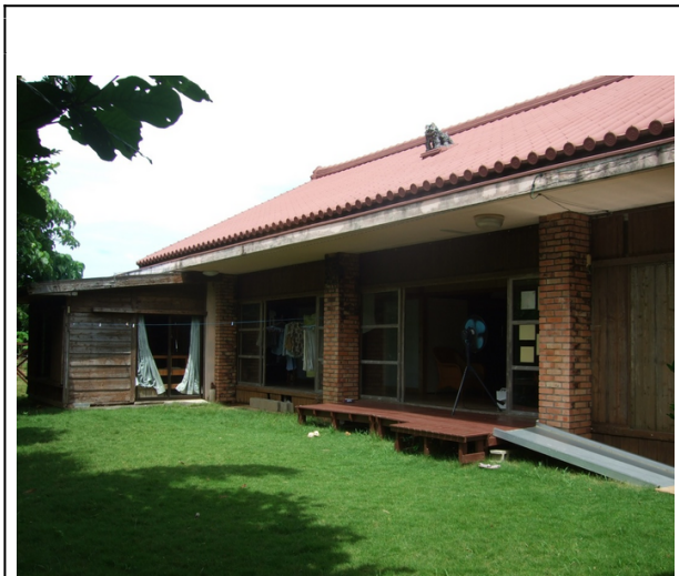
A traditional shisa guardian deity watches over the inn at Iejima

The inn, designed by an architecture student in lieu of his graduation thesis, captures perfectly Kimura’s all-embracing vision. Its walls are open to the elements, there are two large communal rooms and it is fully wheelchair accessible with ramps, low-set light switches and a two-tier stove and sink so people of all abilities can cook together.