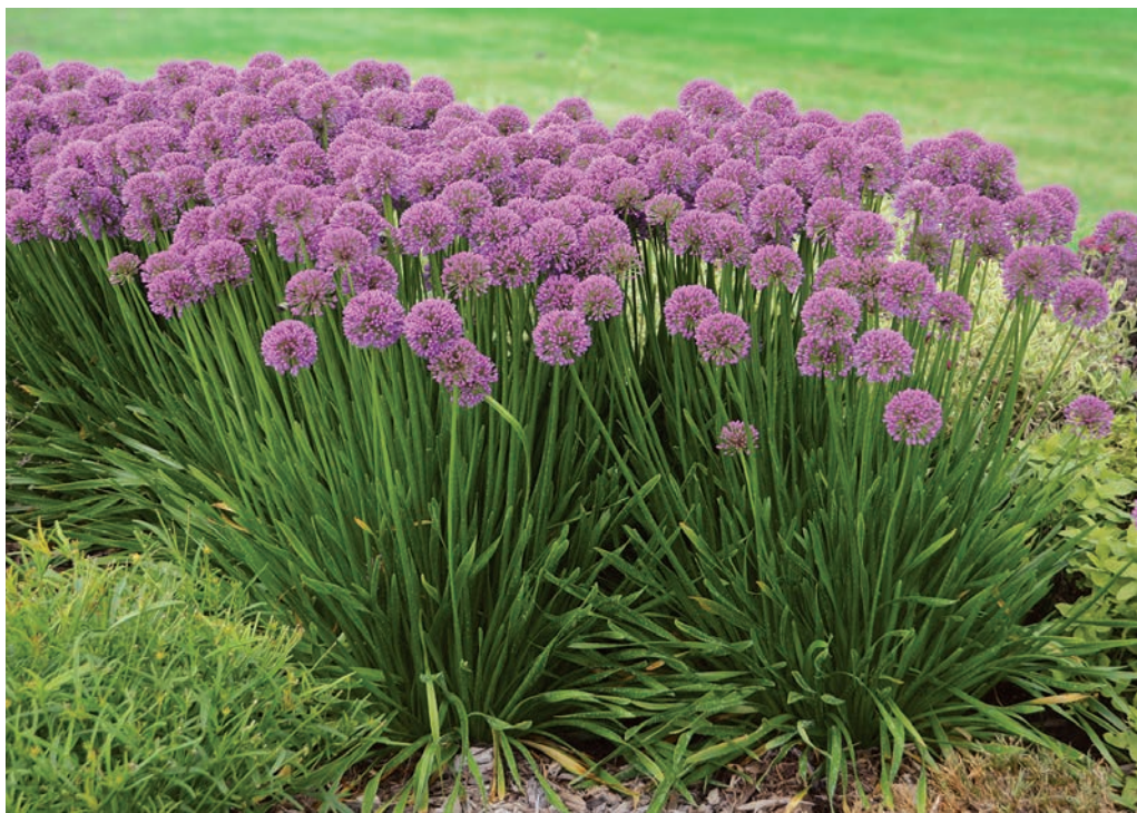
'Millenium' is considered one of the best selections to come along in years, and for good reason—it blooms profusely, its flowers last for about a month, and it won't reseed and become invasive.

Another hybrid derived from A. senescens is 'Pink Planet', which features three-inch-wide pale pink or lavender flower heads in mid- to late summer. Plants grow eight to