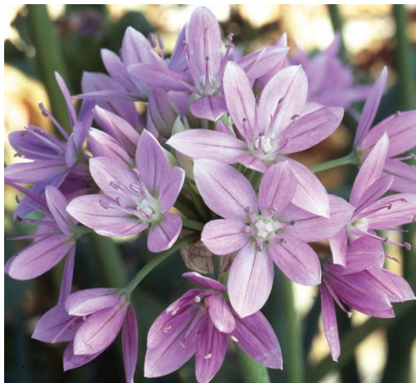
The flower heads of one-leaved onion are comprised of 15 to 35 lavender-pink flowers.

One-leaved onion ( A. unifolium , Zones 4–9, 9–1) is native to cool, moist coastal ranges of California and Oregon and thus more tolerant of moisture than most alliums. Despite its name, it has two