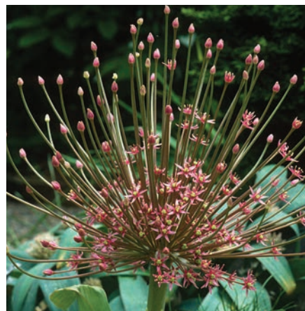
Unlike the dense flower heads of most big-headed alliums, those of Allium schubertii are open and skeletal.

The star of Persia ( A. cristophii , Zones 3–9, 9–5) bears eight-inch balls of loose, shaggy, metallic blue-violet florets on