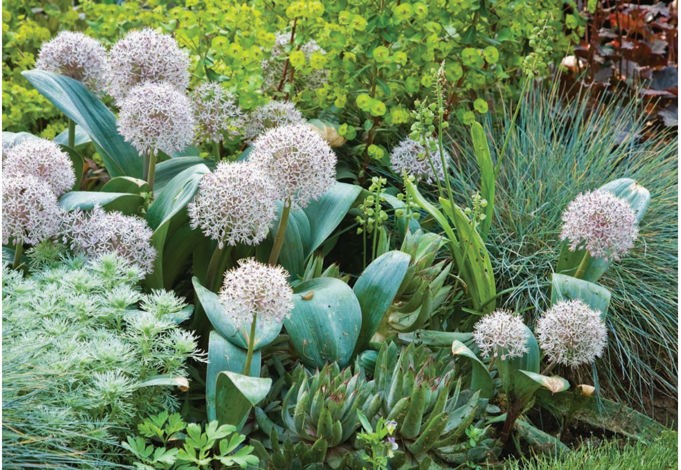
Low-growing Turkistan allium is especially suited for the front of borders. In this mixed bed with a cool, predominantly blue color scheme, it harmonizes well with other blue-leaved plants such as Euphorbia sp., blue fescue ( Festuca glauca ), Sempervivum tectorum , and Artemisia sp.

ed after, smitten by a catalog photo of a softball-sized flower atop a tall scape that dwarfed the small child beside it. The fall after my success with Persian alliums, I made haste to the garden center and spent a small fortune on giant alliums.