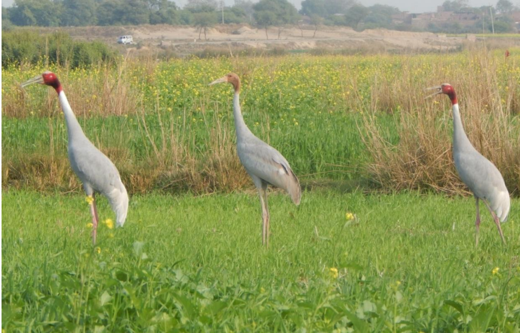
Fig. 4. Sarus crane pair with juvenile in agro paddy field around Alwara Lake