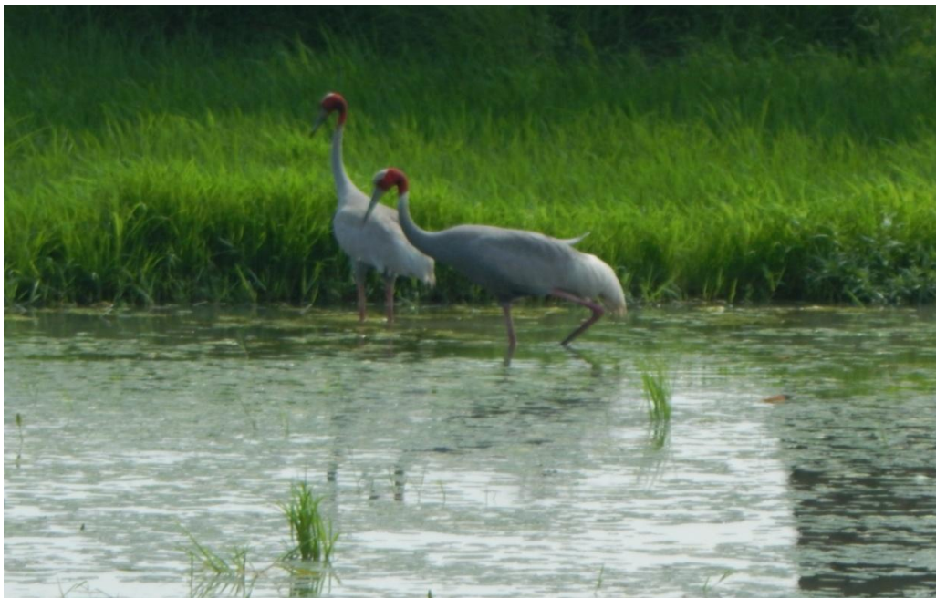
Fig. 3. Paired sarus crane in study area around Alwara Lake