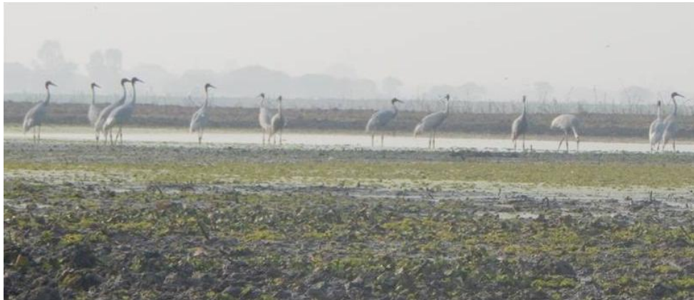
Fig. 6. Sarus crane in congregation in evening around the study area