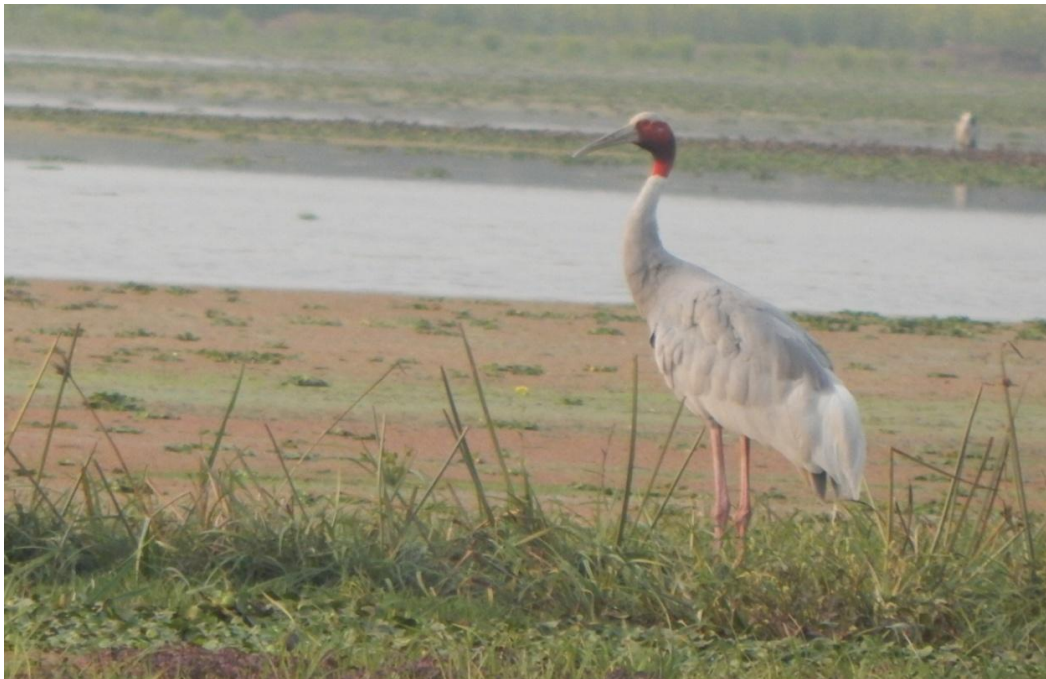
Fig. 5. Sarus crane in solo around the study area