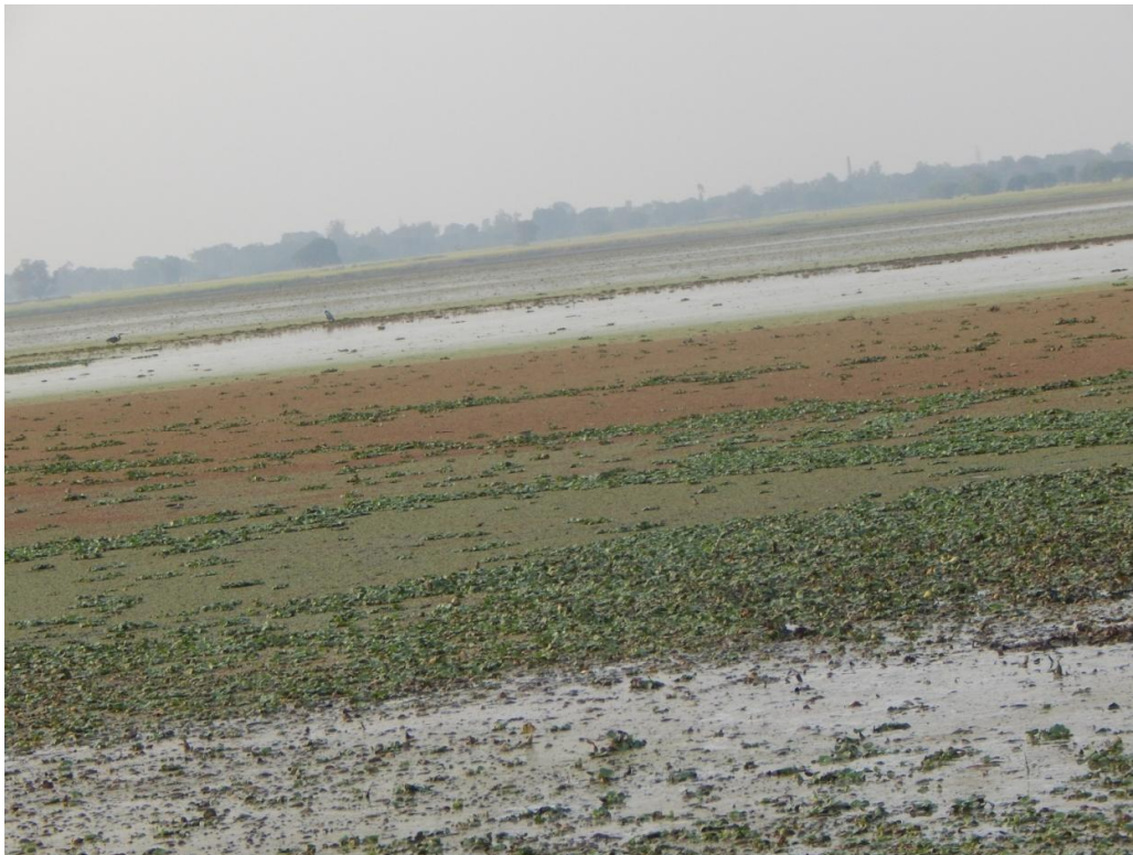
Fig. 2. A view of Alwara Lake of Kaushambi, U.P. (India)