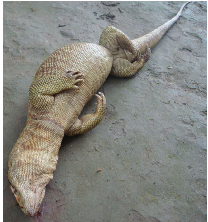
Figs. 4 and 5. An adult V. flavescens killed by local people.