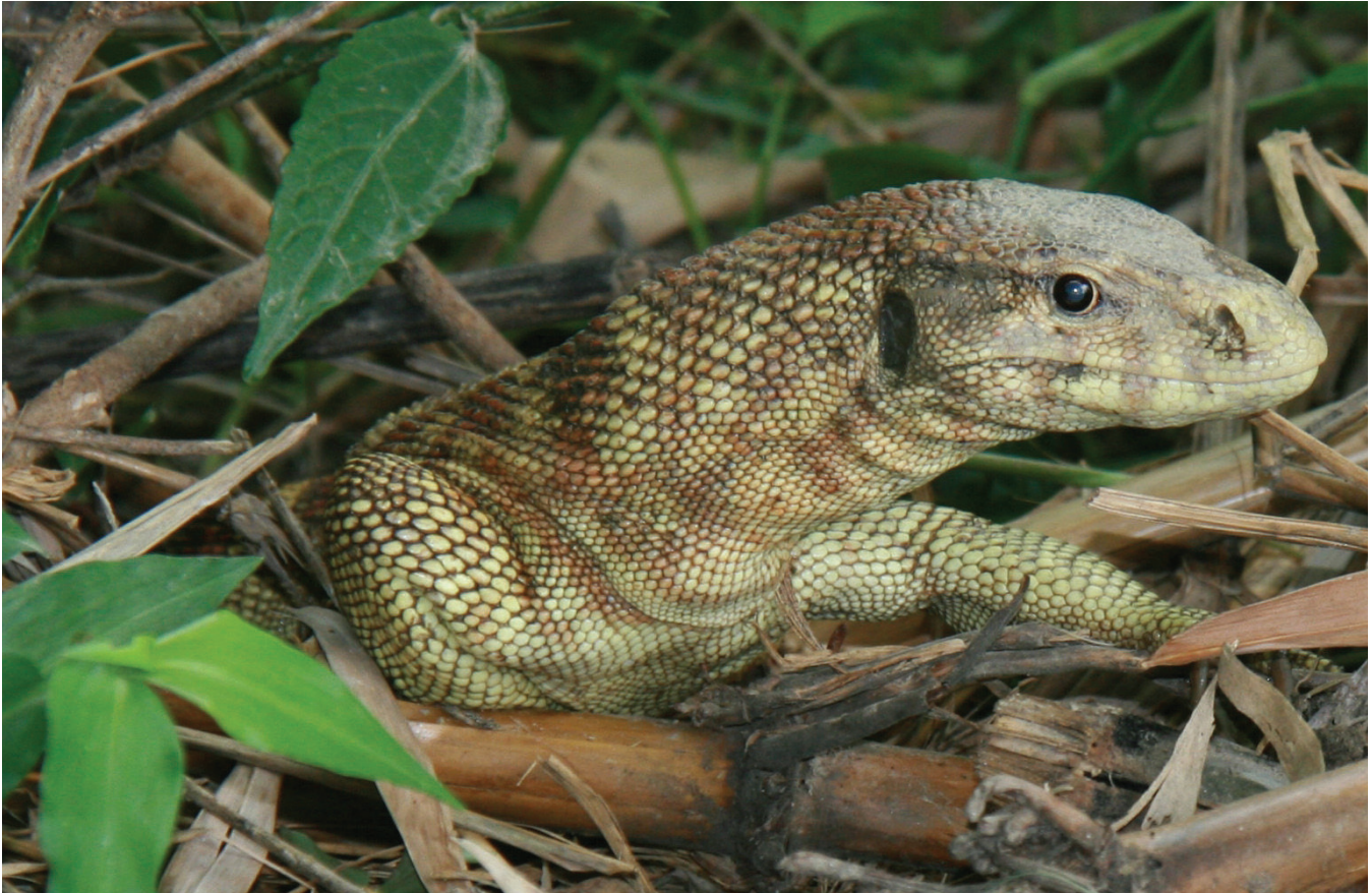
Fig. 2. Varanus flavescens from Jhuwani, Chitwan.