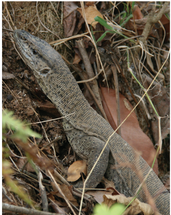
Fig. 3. V. bengalensis bengalensis from Gyalchok, Gorkha, Nepal. 715 m elev.

Information on the current conservation status of V. flavescens in Chitwan was obtained through multiple field surveys and via interviews with local people. Interviewees were representative of multiple ethnic groups and castes, with the Tharu people being the dominant community among the areas. Tharu communities are found closer to the forest and are primarily dependent on the natural resources. The Bachhauli and Kumroj areas contain the largest populations of Tharus, where farming and fishing are the major activities of these people. These areas have four bodies of water adjacent to the village: Dhure Khola, Icharni Khola, Budi Rapti and Rapti Khola. Most of the V. flavescens were sighted in forests and croplands near these bodies of water. Varanus flavescens is also very common in rice fields. It prefers swamps, but is also found in forests and cultivated lands (Shah and Tiwari,